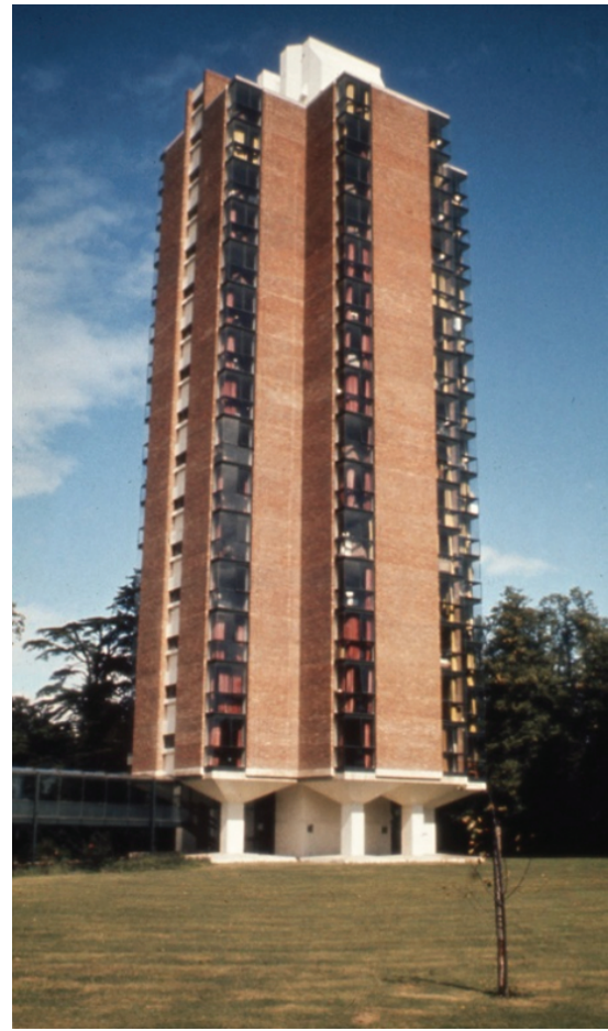
Figure 3. High rise loadbearing construction.

All these missing or inadequately covered ones were brought together in a third part of the BS 5628 series as BS 5628: Part 3 in 1985 (BRITISH..., 1985b). For the first time the UK had a suite of Code of Practice that covered masonry comprehensively.