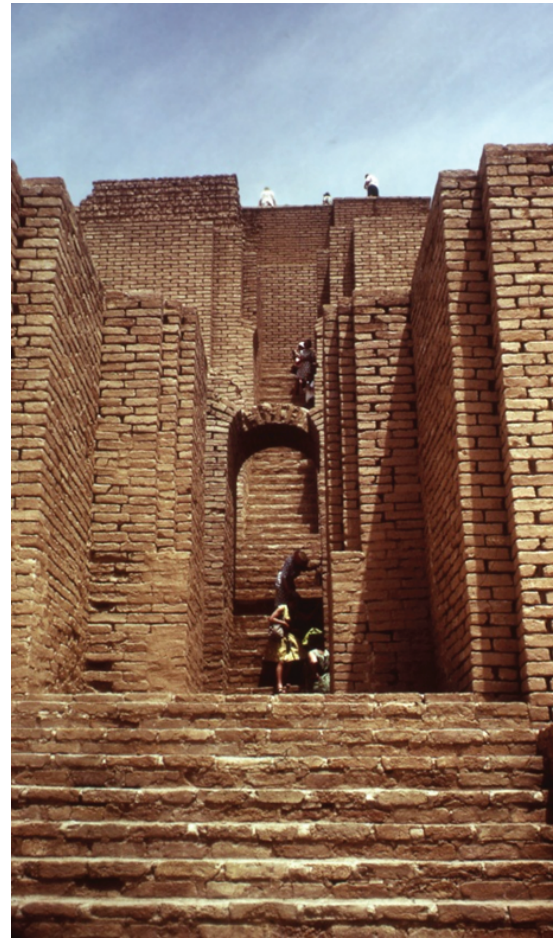
Figure 1. Ancient brickwork – the Chogha Zanbil ziggurat.

With the onset of the industrial revolution, more ‘science’ was gradually employed in the production of materials and the knowledge of mechanical behaviour improved dramatically, leading to more understanding of the design of masonry for structural use and eventually to properly ‘engineered’ masonry. In the UK there was no Code of Practice that covered any aspect of the design of masonry before 1948, when CP 111 Structural recommendations for loadbearing walls (BRITISH..., 1948) was published through the good offices of the Ministry of Works – a government department. For very many years, since soon after the Great Fire of London in fact, there had been regulations for use in the city (the inner part of London as we know it today) initially covering construction so as to limit the spread of fire, but then covering the structural design of several materials in a very basic way. Masonry was given a huge boost by the Great Fire, as the rules to limit spread of fire effectively required masonry to be used (mostly clay with some stone) for the separation between dwellings. The design for masonry was simply a case