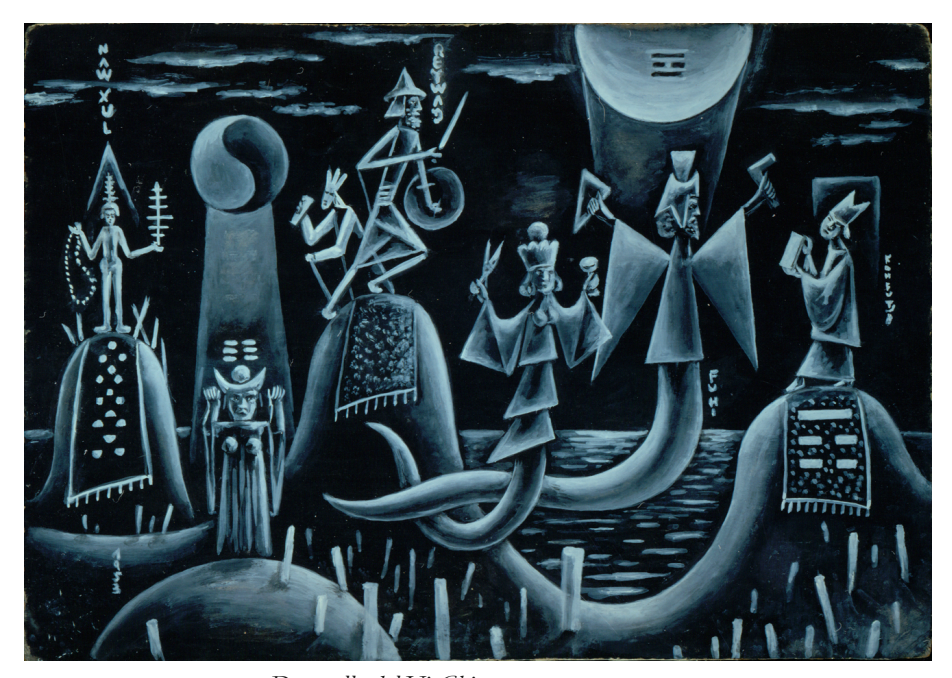
Desarollo del Yi Ching

Among a number of curiosities in his archives, we find a detailed description of a "Sistema de escritura condensada y abreviada" [System of Condensed and Abbreviated Writing] named Densografia [Densography], filed in Buenos Aires in the Registro Nacional de la Propiedad Intelectual [National Registry of Intellectual Property]. More than anything else, the publication Larjentidiome . Folletin Mensual Novel Idioma Argentino , edited by T.J. Biosca (1 April 1946), is folkloric. The motto of the review –whose cover is illustrated by two photographs of equal size of D. F. Sarmiento and its editor T. J. Biosca (!)— is "El novel idioma Argentino no teraa ke als Arjentinos nos digan Argentinos perfeccion gramatical". This linguistic system also justifies itself through brotherhood and social justice: "Larjentidomaestriases panamerigloble argentryankifrances sistem Biosa".