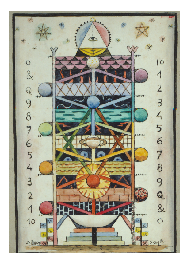
Pan árbol, 1954, acuarela y tinta sobre papel montado sobre cartón, 35,5 x 24 cm