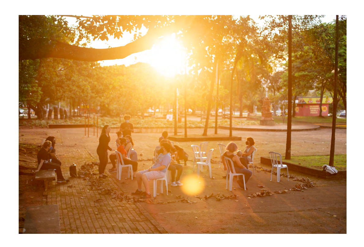
Figura 6. Companhia. Apresentação em espaço aberto, no fim de tarde da Praça Universitária em Goiânia. 2022.

O líder indígena e filósofo brasileiro Ailton Krenak reflete que a ideia judaicocristã do ser humano se descolar da terra para viver "numa abstração civilizatória, é absurda. Ela suprime a diversidade, nega a pluralidade das formas de vida, de existência e de hábitos. Oferece o mesmo cardápio, o mesmo figurino e, se possível, a mesma língua para todo mundo" (Krenak 22-23). Vamos ficando sem possibilidades de expressar ou pensar as nossas subjetividades, acreditando numa maneira correta e única de entender, sentir e fazer arte.