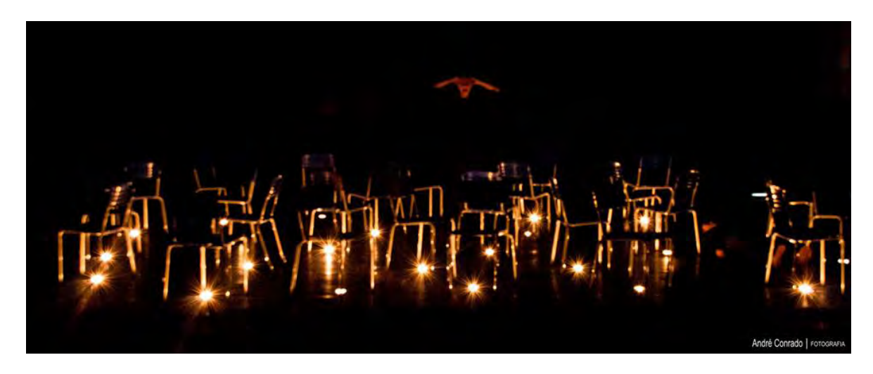
Figura 5. Companhia. No centro da fotografia o ator Ronei Vieira. Apresentação no Espaço Sonhus em Goiânia. 2015.

Existe realmente nessa montagem uma característica ritualística. As cadeiras em que o público irá se sentar para vivenciar a performance estão localizadas dentro de um círculo de folhas secas e, debaixo de cada um dos assentos, há uma pequena vela aromática acesa. O público posiciona-se sentado em forma aleatória, onde as cadeiras não se encontram ao lado da outra, mas dispersas. E direcionadas a centros distintos, com espaços entre elas, para estimular o isolamento da audiência.