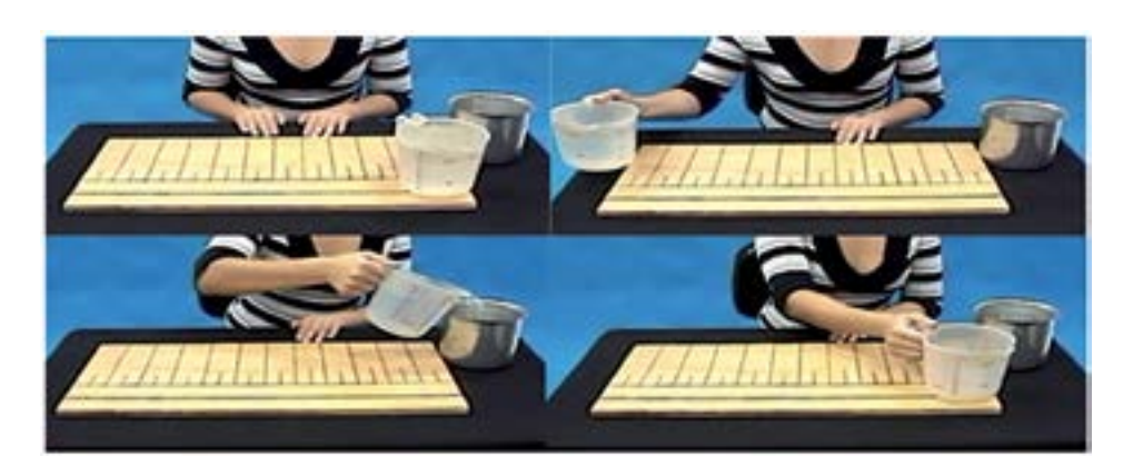
Figure 2. Sub-items of the Elui Test - Pouring water (Initial position and the performing phases of the item)