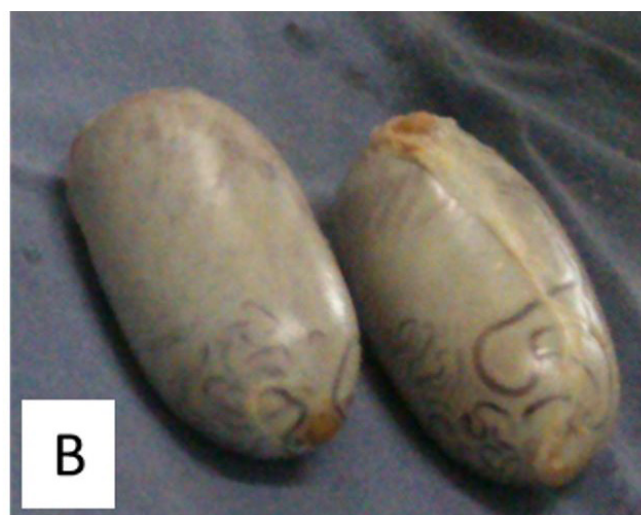
Figure 1 – Testes of the intact bulls (A) and immunocastrated bulls (B).