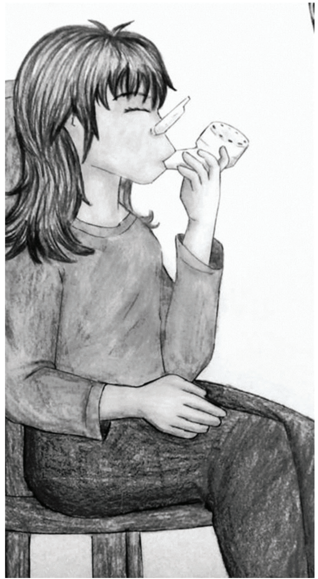
Figure 2 - Illustrative image showing a patient performing oscillating positive expiratory pressure therapy for 5 min in a sitting position.

All samples were processed according to the previously published protocol (18). Briefly, sputum was separated from