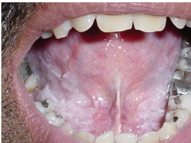
Figure 5 - Ventral surface of tongue and floor of the mouth after 2 weeks of peroxide mouthwash.

Uremic stomatitis was first described as a red mucosa covered with a pseudomembrane and ulcerative forms. Clinically, adherent white lesions arise on the dorsal, ven-