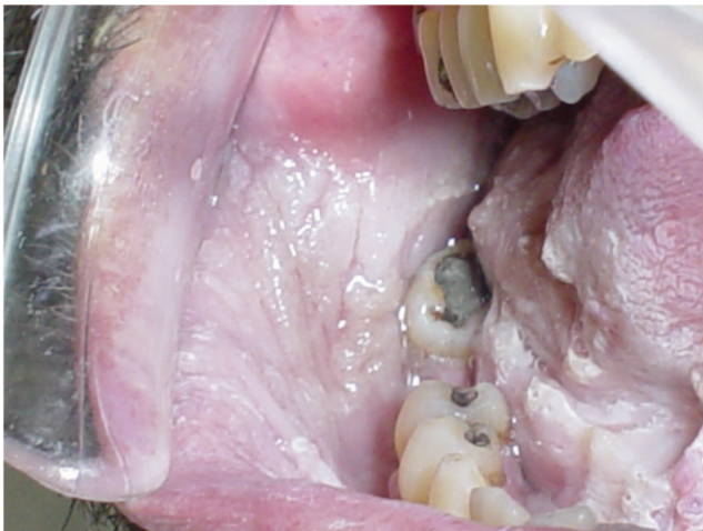
Figure 2 - Widespread white patch on buccal mucosae and floor of the mouth.