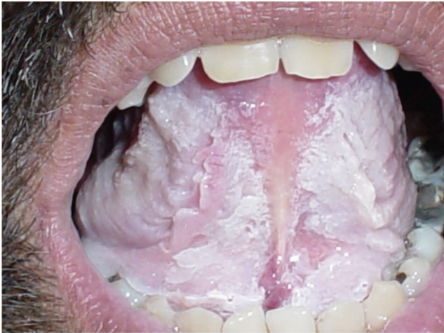
Figure 1 - Adherent white patch on ventral surface of tongue and floor of the mouth.