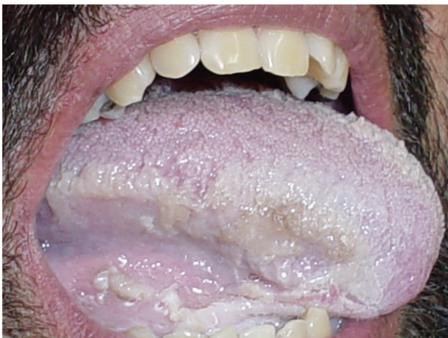
Figure 3 - Adherent white patch on right side of lateral border of tongue.

served in this patient. However, OHL seemed unlikely in view of the generalized nature of the oral white patches. To establish the precise diagnosis, incisional biopsies of the left and right borders of the tongue were undertaken.