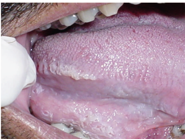
Figure 6 - Lateral border of tongue and floor of the mouth after 2 weeks of peroxide mouthwash.

tral, and lateral parts of the tongue, as well as in the buccal, labial, or retro-molar areas. 4 However, some patients may have an exudate from the oral mucosa, together with ulcerative lesions of the skin. 7 Gingival and mucosal swelling may also occur. The clinical diagnosis of possible uremic stomatitis is difficult, since the description of the disorder is similar to that of other common diseases affecting the oral mucosa, and few clinical images of the lesions are available.