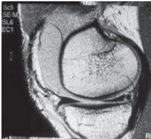
Figure 1 - NMR image showing a medial meniscal injury

n = number of patients. p = relative frequency