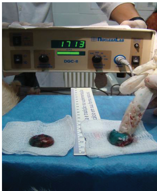
Figure 5 - Measurement the radiocolloid uptake ex vivo after the removal of the SLN.

We recorded all radiation rates at the injection site before the incision was made in the armpit, the sentinel lymph node radioactivity in vivo and ex vivo and the radioactivity from the central bed where the sentinel bed was located. The parameter used was the background radioactivity (radiation control). The tabulated data quantified the intersection between the two markings and the correlation between the methods.