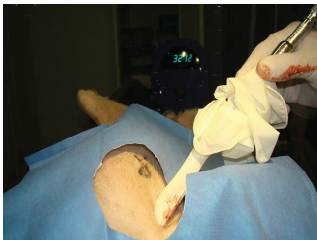
Figure 2 - Performing axillary mapping using a gamma probe to identify the location of the projection of the sentinel node in the axilla.

After incision and hemostasis by compression of the wound, 0.5 ml blue dye (bleu patenté V Guerbet 2.5%) was injected just above the midpoint of the arcuate top edge of