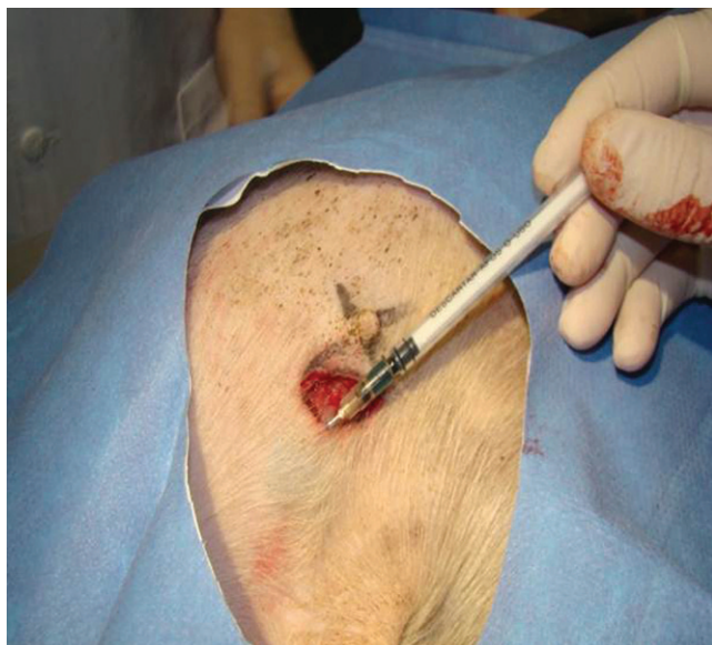
Figure 3 - Injection of blue dye (bleu patenté V Guerbet 2.5%) just above the midpoint of the arcuate top edge of the incision in the subdermal region.

the incision in the subdermal region (Figure 3). Local compression and gentle massage at the site of injection were applied to prevent the contrast from spreading farther and to allow it to be transported by the lymphatic network of the area to the sentinel node.