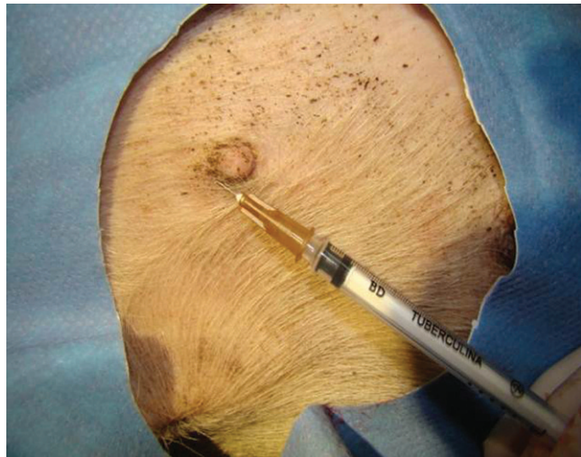
Figure 1 - Intradermal injection of 99mTc into the subareolar region of cranial thoracic breasts using a fine-gauge insulin needle.

After immobilization on the operating table with the legs abducted, the animals were anesthetized subcutaneously with 0.05 mg/kg atropine (Centralvet®, Brazil) followed by 15 mg/kg ketamine hydrochloride (Syntec®, Brazil) and 1.5 mg/kg xylazine hydrochloride (Syntec®, Brazil) intramuscularly. The level of anesthesia was monitored continuously by clinical parameters, such as movements of the nostrils and other muscle groups and respiratory and cardiac rates. Additional anesthesia was provided as required. Venipuncture in an upper paw with a 9- or 21-gauge "scalp" needle was performed for the administration of 0.9% saline to secure adequate venous access. The surgical areas of the breast and axilla were shaved to remove excess hair. Subsequently, 0.2 ml Tc99 phytate was injected intradermally using a fine-gauge insulin needle in the subareolar region of both cranial thoracic breasts (Figure 1). Two-minute bidigital massage was provided to