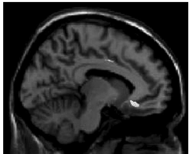
Figure 1 - Correlations between Neuropsychiatric Inventory scores and reduced gray matter volume in different areas of the brain. The results are displayed at an uncorrected p < 0.001 level and plotted onto the SPM5 canonical T1 image for the purpose of illustration.

Neuropsychiatric symptoms were very prevalent in our sample of mild AD patients. Of these symptoms, irritability was the most frequent abnormal behavior, followed by apathy, agitation, delusions, and euphoria. These behavioral problems associated with AD tend to show a trajectory of increasing prevalence and severity over time, an attribute they share with cognitive and functional decline. 4 Our paper confirms the high prevalence that was also seen in other studies. 5,20 This different prevalence of some Neuropsychiatric Inventory domains could be explained by the exclusion of highly symptomatic depressive patients, the different dementia stage of our sample, differences in cultural manifestations of behavior, and sample size. A wide variation of the Functional Activities Questionnaire scores (1-22) was also observed. This assessment tool is based on caregiver judgement, generally influenced by the burden of care and cultural aspects of reported disability. 21 We also observed a positive correlation between cognitive test scores and grey matter volume of frontal and temporal structures.