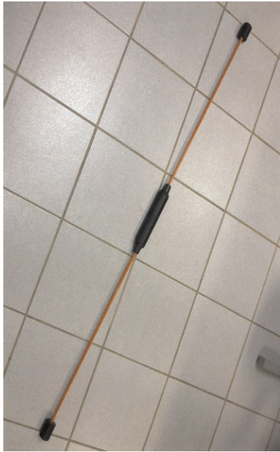
Figure 1 - Example of a flexible pole (Flexibar®) used in our study.

50-60 seconds of rest between each exercise. Three repetitions were performed for each exercise (6).