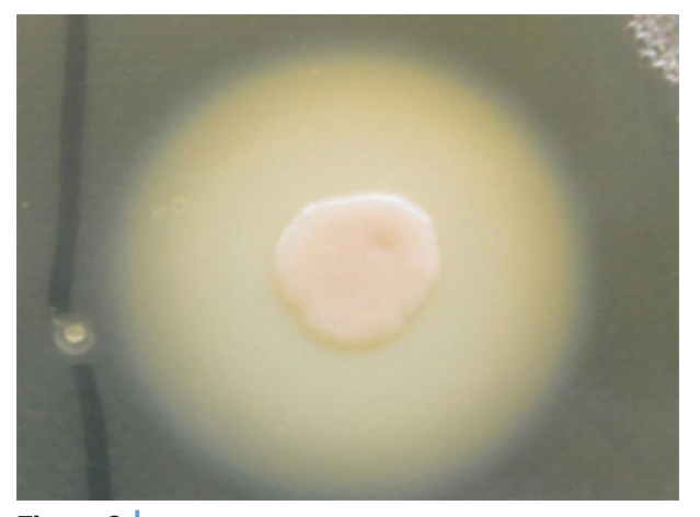
Figure 2 Calcium chloride precipitation zone due to phospholipase by C. neoformans strain.