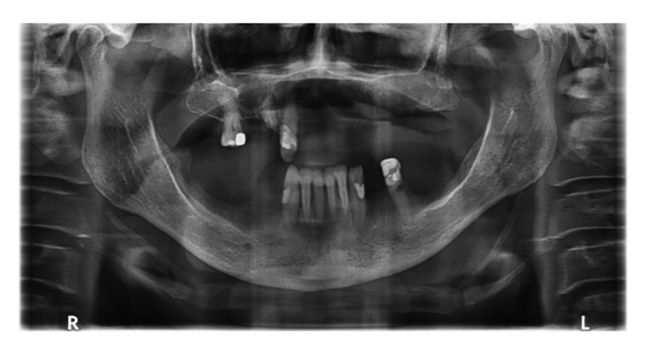
Figure 1 Panoramic radiograph of the case. Opacification of left maxillary sinus floor and lateral wall.

Due to the presence of bone erosion and the need for maxillary sinus elevation, the patient underwent an endoscopic sinus examination. The final diagnosis was determined through evaluation of sinus content removed during the procedure and defined as mucocele of the maxillary sinus.