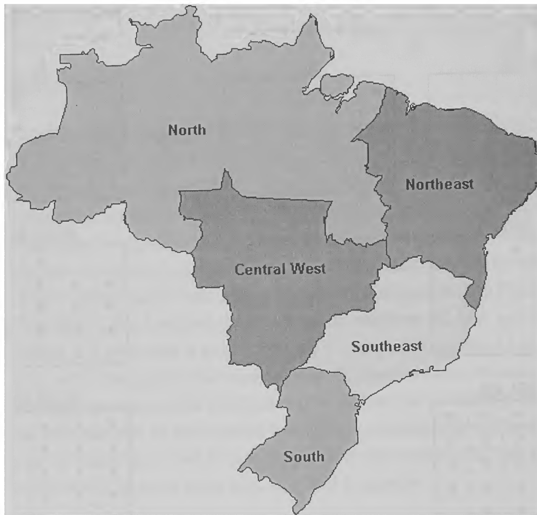
Figure 3 Map of Brazil and Its 5 Macro Regions

The overall size of the Brazilian territory is 8,511,996 Km 2 of which 45.25% belongs to the North region, 18.25% to the Northeast, 18.85% to the Central West, 10.85% to the Southeast, and 6.76% to the South. However the economic and population distribution do not follow the geographical distribution, as can be seen in Table 2.