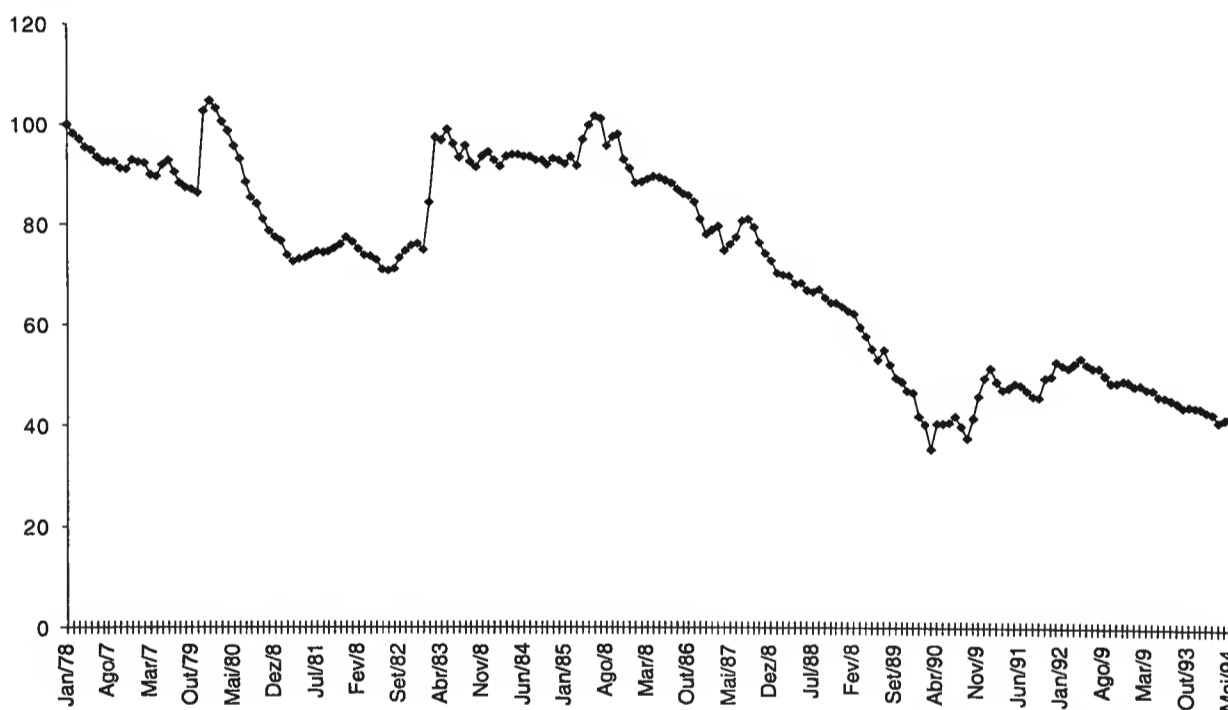
FIGURE 1- REAL EXCHANGE RATE - (JANUARY 1978 - JUNE 1994)

An important preliminary step is to identify determinants of f(e, t) , in equation (1). There is nevertheless considerable controversy over the choice of fundamentals in exchange rate determination. 4 The variables to be chosen should