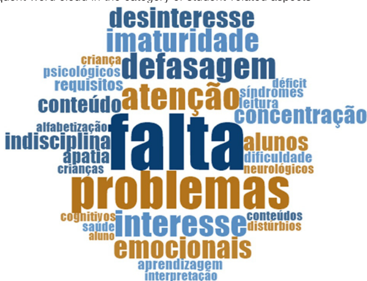
Figure 2 - Most frequent word cloud in the category of student-related aspects 5

In addition to the scarce involvement of families towards the school, teachers also think children are deprived of preconditions and skills which prevent school learning or make it difficult. 69.92 percent of the participants in the study associate the causes of the learning obstacles with the students’ deficits, stressing the lack of interest, attention, concentration, discipline; as well as the loss of maturity, prerequisites, background, beside emotional problems. The cluster of words standing out has to do with lack of interest [falta de interesse] or desinterest, mentioned 36 times. These are some examples found in the questionnaires: “immaturity, lack of interest, absence of prerequisites” (a first-grade teacher); “no interest and apathy in school” (a second-grade teacher); “unmotivated child who has already a very specific discrepancy preventing him or her from advancing” (a fourth-grade teacher); “loss of interest, content-related discrepancy” (a fourth-grade teacher).