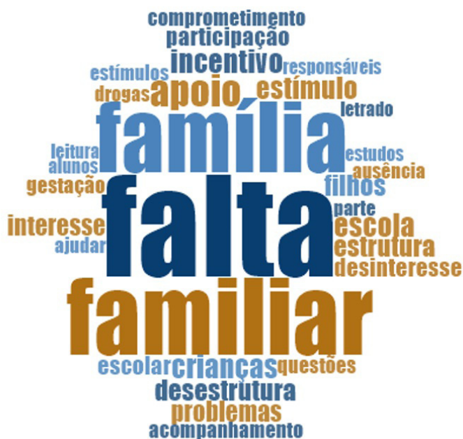
Figure 1 – Most frequent word cloud in the category of family-related aspects 4

Teachers believe that learning difficulties result especially from the lack of interest and support by family members when dealing with school issues of their children; dysfunctional families are also mentioned. Absence [falta] is the key word to understand how teachers see their students' parents, appearing 78 times. Both encouragement [incentive] and stimulus [estímulo], used interchangeably, came up 21 times. The word support [apoio] was mentioned 18 times. Both disorganized and dysfunctional families counted 18 mentions. Loss of interest [falta de interesse] and disinterest at all are highlights in 15 quotations, as well as the lack of commitment and monitoring. In the focus group, a second-grade teacher moaned: “the families don’t care. This year, I have been everything but not a teacher; I have served as a nanny and a rescuer. I have broken up fights all the time. How am I going to be able to teach in such reality?”