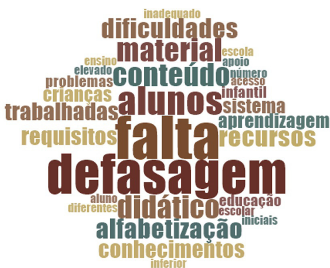
Figure 3 – Word cloud of most frequent word cloud of aspects related to the educational system and school context 6

The questionnaires show that 39.10 percent of the teachers include the dimension of the educational system, the specific context of each school, teacher training, and the theoretical/methodological approach as factors that lead to learning difficulties. These aspects were widely discussed in the focus groups. More specifically, teachers complained they were not free to choose the pedagogical approach of their like. They also said that the training provided by the National Pact on Literacy at the Proper Age (BRASIL, 2012) brought no significant contributions to achieve an effective classroom practice; on the contrary, such trainings usually caused disturbance, and that was why they were called teacher deformation . The market for in-service ongoing training was disappointing for teachers because they were often out of contextualized, based on a Eurocentric and idealized child psychology, with nothing to do with today's Brazilian children living in urban poor fringes, with a history of racism, exclusion, and deprivation. Such trainings usually ignored how complex are the factors involved in teacher/student relationships in public schools.