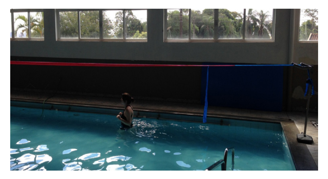
Figure 1. Three-minute walk test in water (3MWT-W)

The test was conducted at least two hours after meals. Participants were told to use their own, comfortable clothing to the aquatic environment. Prior to the test, they maintained 10 minutes of rest, during this period their PA, level of dyspnea and lower limb fatigue using a modified Borg scale<sup>20</sup>, SpO2 and HR were evaluated. The maximum heart rate was calculated according to the of Karvonen formula (220 - age)<sup>22</sup>.