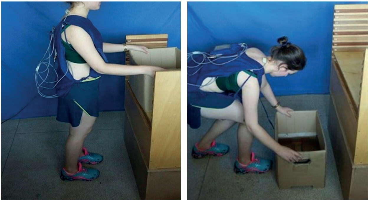
Figure 2. Data collection setup