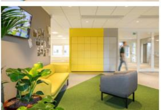
Figure 2. Menzis Building in Enschede, the Netherlands