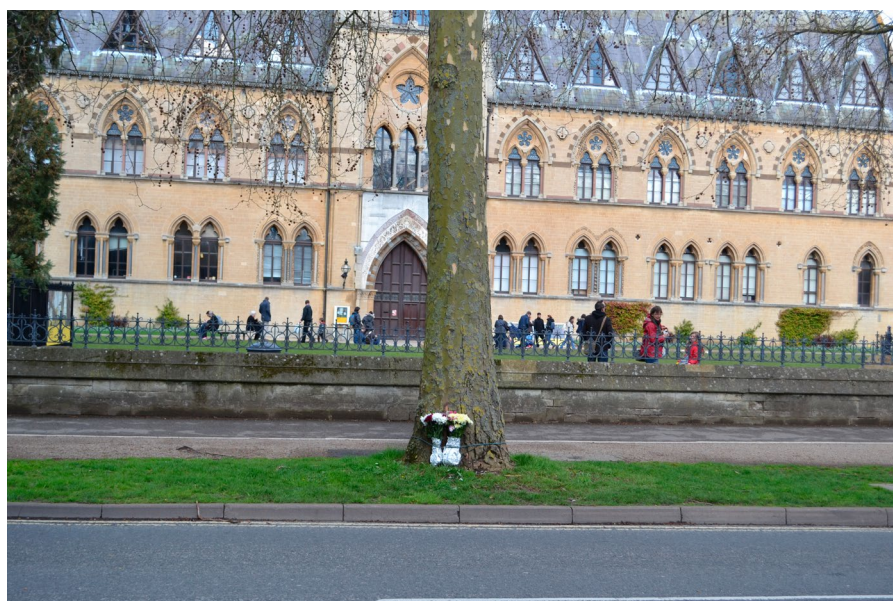
FIGURE 2 Tribute Flower on the sidewalk tree in front of the Natural History Museum building that holds the PRM.

But I was surprised when I began to find, as illustrated in the following photo (Figure 2), objects related to communicating with the dead in the city of Oxford, in 2016.