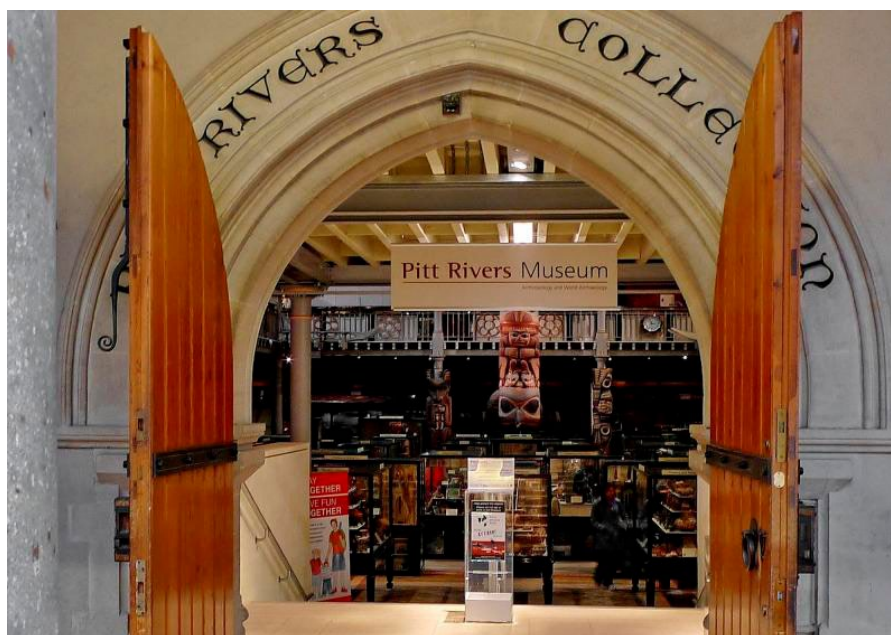
FIGURE 1 Inside of the Natural History Museum building that gives access to the Pitt Rivers Collection Portal.

Recently, the museum's research team discovered that the PRM maintains a significant collection of English amulets and charms, stimulating a series of relevant researches.