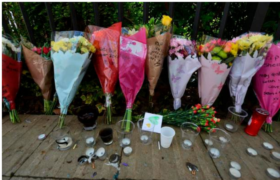
FIGURES 3ii and 3iii Detail of Tribute Flower on Iffley Road.