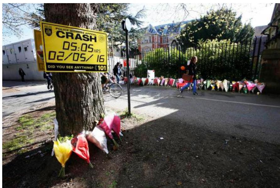
FIGURE 3i Tribute Flower on Park Road, between the PRM and the University Parks.