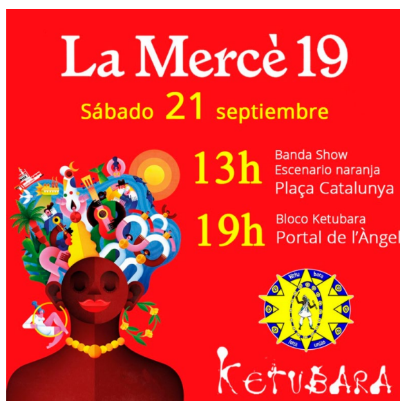
FIGURE 10 Photograph: Festa La Mercè's poster 6 .

Furthermore, I acknowledge that Brazilian and Spanish groups are transforming the music consumption practices that characterized them previously. Some Brazilians are “Spanishizing,” appropriating the local festivals ( Sant Joan, La Mercè ); while some Spaniards are “Brazilianizing” (with samba-reggae and batucadas). This blending of rhythms creates new sound spaces and new ways of experiencing Brazilian music abroad, as it is illustrated in the poster below.