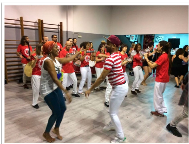
FIGURE 11