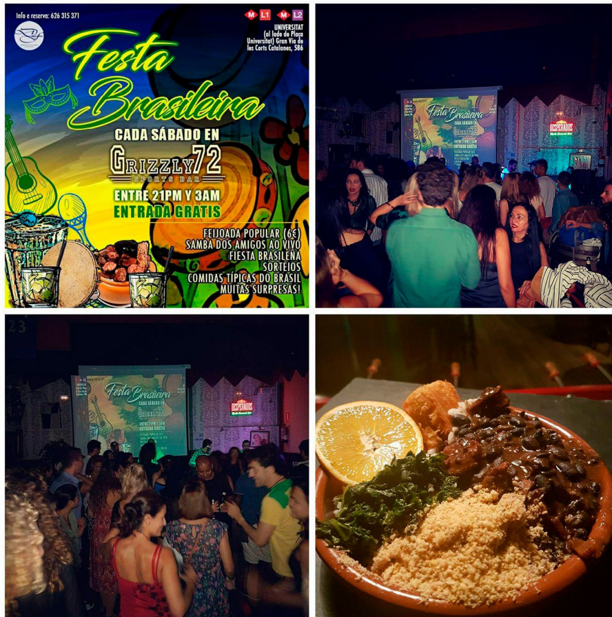
FIGURE 1 Photograph: Grizzly Bar Poster.

At some point, I started listening to Caipirinha Libre to get more specific data about the Brazilian music scene. Caipirinha Libre is a radio show with interviews and chats broadcast live every Wednesday from 6:00 pm to 8:00 pm on contrabanda.org and on the radio station 91.4 FM. It is a radio show with DJs from Barcelona, guests, musicians, and artists who live or are visiting the city. According to the announcer, “it is a way to keep updated on Brazilian music.”