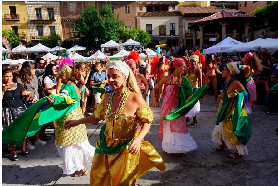
FIGURE 5

The following photograph shows the appropriation of Brazilian culture and its legitimation supported by the baianas ' (women from Bahia) section using the national flag. In addition, costumes, sonority, and gestures are resignified in this parade.