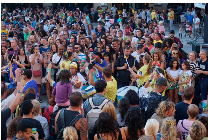
FIGURE 9