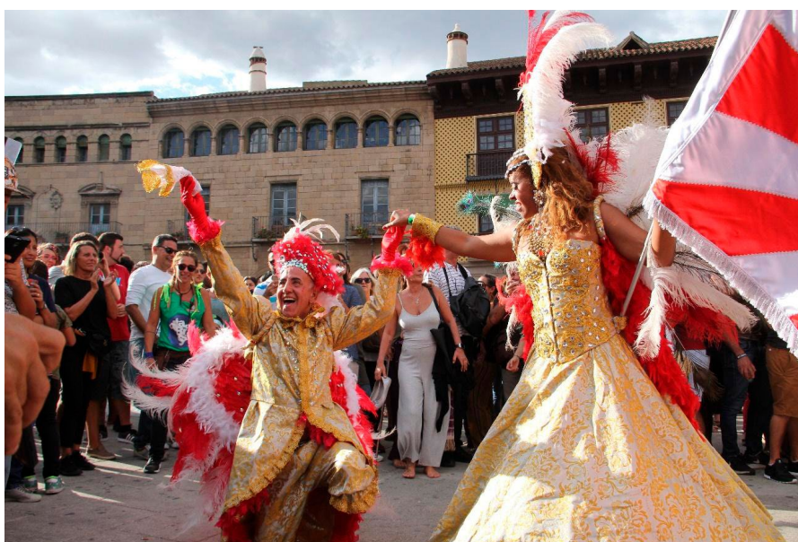
FIGURE 4

Every year, festival organizers bring artists from Brazil and Brazilian artists who live in Barcelona. The lineup encompasses two rhythms: samba and forró, because they are more accepted abroad. The 2017 edition included artists such as Mariene de Castro, Barbados Samba , Sapato Branco , and the DJs MDC Suingue and Massafera Soundsystem . There were also capoeira and maculelê presentations with Cordão de Ouro , samba school Unidos de Barcelona , Ketubara Batucada , and Batalá Batucada .