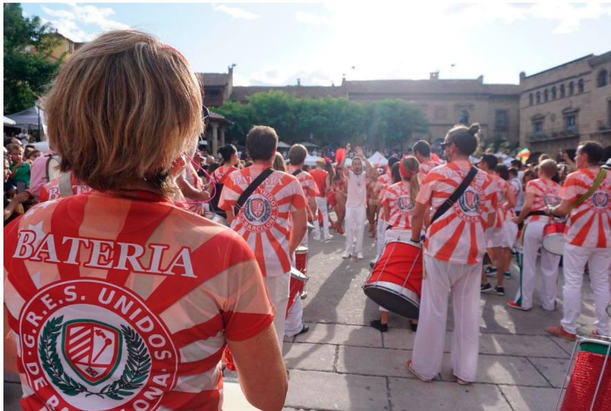
FIGURE 6

Batucada is another musical phenomenon. What we know as samba-reggae is called batucada in Barcelona. Batucadas are percussion groups composed of 15 to 50 people who occupy and walk the city streets during the European festivals.