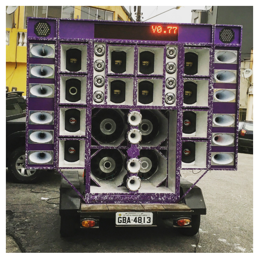
Photo 2: Sound wall with a total of 40 speakers (between treble, mid and bass) parked in front of a bar in the South Zone of São Paulo, March 23, 2017.

The young evangelical shows that parties disturb the sleep of workers who want to rest. However, most young people find the possibility of having fun and leisure within reach in terms of income. Because it is open, it is affordable music. In addition, the parties still present themselves as a possibility of work for residents to become traders of drinks and food making the income circulate within the community. A complex dimension of the dispute for narratives around the fluxo is just that, just as it bothers a certain type of worker, he (the fluxo ) produces "other workers". Funk produces many types of workers.