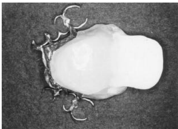
FIGURE 1B AND 1C- Obturator prosthesis with speech bulb

This posterior portion intends to correct or at least reduce the effects of the velopharyngeal dysfunction. Basically, this portion can belong to three different kinds depending on the velopharyngeal dysfunction's etiology.