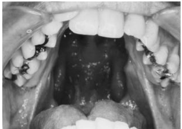
FIGURE 1A- Patient with open palate

The making of the posterior portion was begun just after the patient was used to the anterior prosthesis 9 . A brass wire was adapted to the end of the prosthesis to mold the posterior portion, which supported the impression compound. The wire was folded so that it