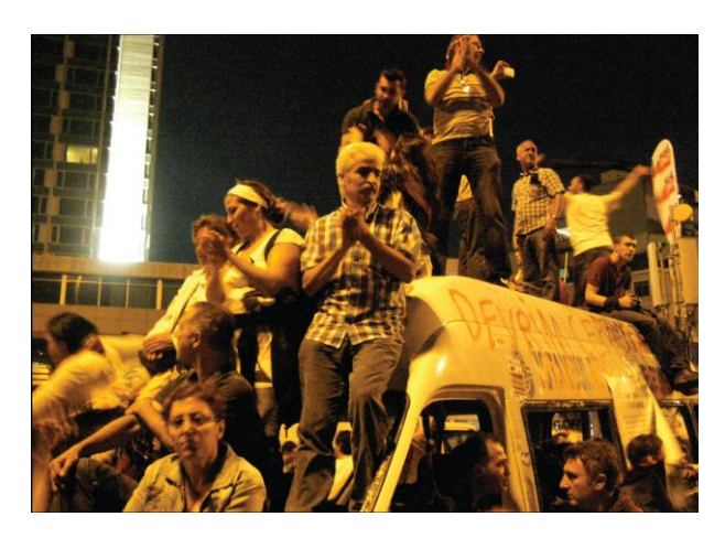
Figure 2-Protesters in Istanbul, 2013.

If we can return to an almost religious vocabulary to continue describing this immanent experience, we would say many then experiment an epiphany. They feel another world is possible.<sup>14</sup> For some hours but more usually for some weeks they will share an experience that is seldom available to us. If I have defined it in quasi-religious terms it was deliberate. Each one has then an experience of a different, intuitive, instantaneous knowledge; that is epiphany or revelation. They transgress minor municipal laws; that is a matter of action. Each one knows; they act. And they have an experience of new forms of sociability; this is communion. But, even if two among the three words (epiphany, action, communion) I employed to describe these experiences come from a religious lexicon, they must be understood as experiences from immanence rather than from transcendence. It is not the revelation of a transcendent God, like the one who gave Moses the Ten Commandments. It is not the revelation some great mystics had. It is a revelation of possibilities that lie inside everyone, inside yourself. They are quite democratic and often very cheap, since they break with consumerism. Many a thing, not to say everything, seems close at hand. Millennium is imminent, it is portable, but please never forget it has a lay, an immanent character. It breaks with monotheism, with the Religions of the Book, with the traditions of the Jews, the Christians, and the Muslims.