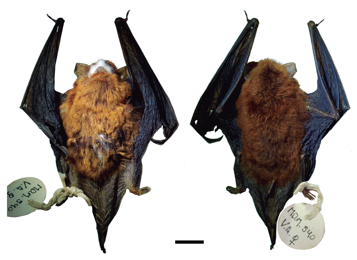
FIGURE 3: Dorsal (right) and ventral (left) view of Myotis lavali (CML 7623) from Finca Alto Verde, Salta, Argentina. Scale: 10 mm.

The only two specimens collected were adult females, probably nulliparous according to the condition of their mammae, which were small, whitish, and covered by hairs.