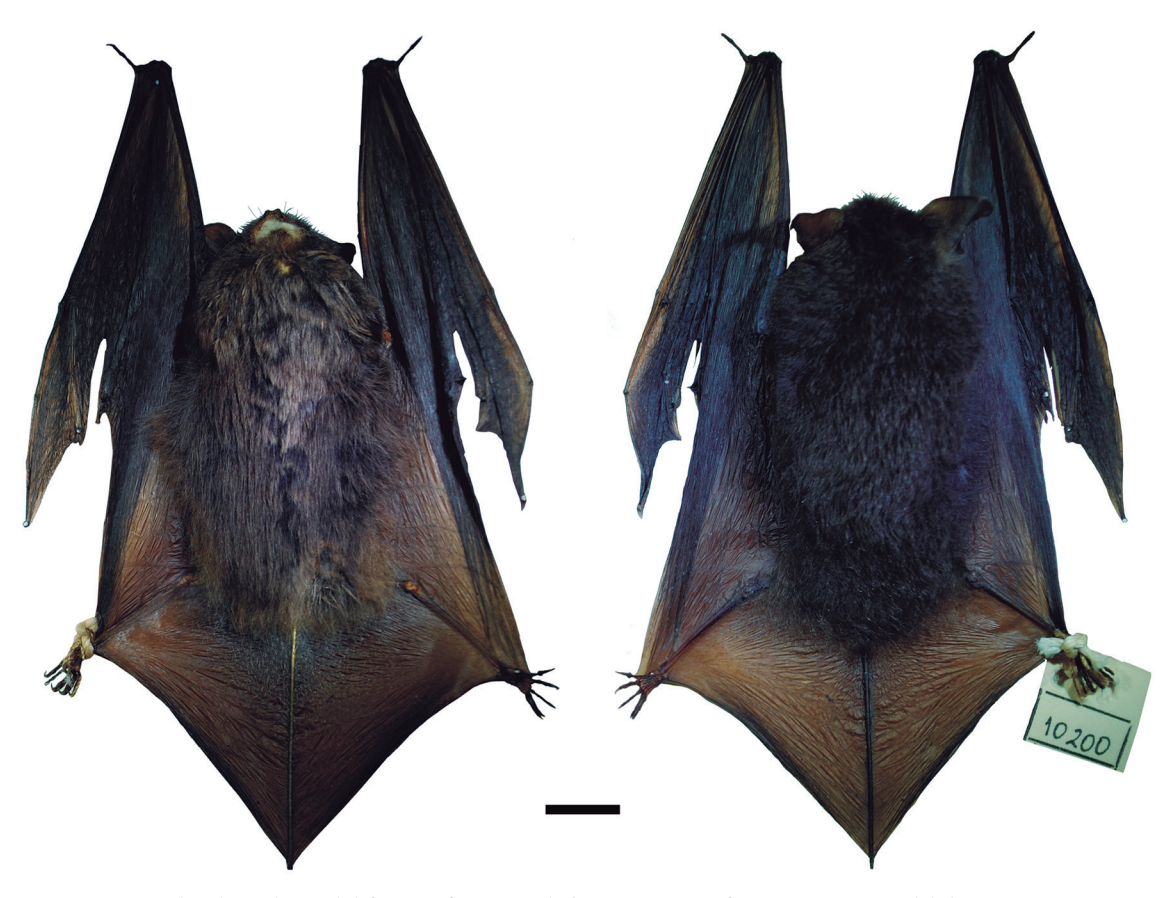
FIGURE 2: Dorsal (right) and ventral (left) view of Myotis izecksohni (CML 10200) from, Parque Provincial de la Sierra "Ing. Agrónomo Martínez-Crovetto", Misiones, Argentina. Scale: 10 mm.

crest present, and second upper premolar not displaced to the lingual side, but generally aligned in the toothrow.