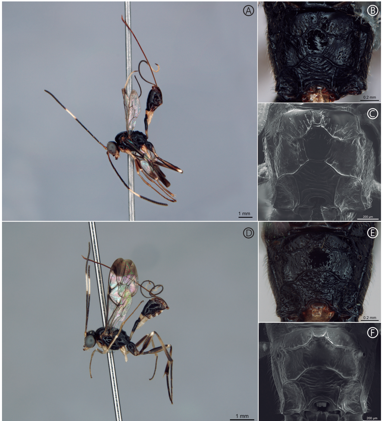
Figure 4. Ptilobaptus cinctus Townes, 1971, females. (A) Lateral habitus. (B) Propodeum, dorsal view. (C) Propodeum SEM, dorsal view. (D) Lateral habitus. (E) Propodeum, dorsal view. (F) Propodeum SEM, dorsal view.

09-21.XI.2016 (1 ♀, INPA); Novo Airão, AM-352, km 68, Igarapé Mato Grosso, 02°48'58"S, 60°55'18"W, Malaise, 14-28.IX.2016, E.F. Morato & J.A. Rafael leg., Rede BIA (1 ♀, INPA); Manaus, Área de Estudos PDBFF, Fazenda Florestal, Reserva 1112, 02°26'57"S, 59°46'13"W, 26.IV.1985, col. Bert Klein (3 ♂♂, INPA). PA [Pará], Santarém, BR-163, km 19, Ramal das Lavras, Sítio do Recanto do Sabiá, 02°35'13.0"S, 54°43'15.3"[W], 01-15.II.2019, M.L. Oliveira leg., Malaise grande – Rede BIA (1 ♀, INPA); same, except 15-30.VI.2019, M.L. Oliveira leg Malaise grande, Rede BIA