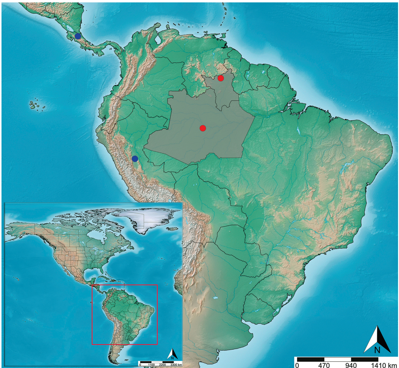
Figure 5. Geographic distribution of Ptilobaptus cinctus Townes, 1971. Legend: Brazilian state records are highlighted in gray. The circles represent the specimens: red for new records and blue for previous records.

Remarks: The males and females of Creagrura nigripes analyzed showed differences in size and color patterns (Figs. 1A-G; 2A-F), with variation in the spots on the propodeum (Figs. 1C-G; 2C-F) and on the hind coxae (Figs. 1A-B; 2A-B). In addition, the median longitudinal carinae (Figs. 1G; 2F) behind the posterior transverse carina (Figs. 1D; 2D) are strongly marked in the propodeum of some specimens (Figs. 1C-G; 2C-F). The variations of these characteristics had already been mentioned by Gauld (2000), who analyzed 87 specimens from Costa Rica, and we also treat them here as intraspecific variations. However, these differences deserve to be evaluated more in-depth in the future, using also molecular data as they can reveal the presence of cryptic species. In addition, a broader sampling of specimens in other environments and biomes is needed to characterize these variations more robustly.