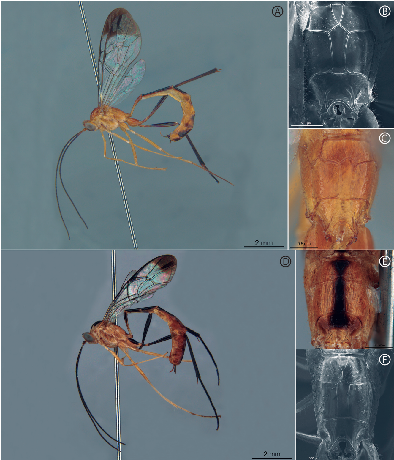
Figure 1. Creagrura nigripes Townes, 1971, females. (A) Lateral habitus. (B) Propodeum, dorsal view. (C) Propodeum SEM, dorsal view. (D) Lateral habitus. (E) Propodeum, dorsal view. (F) Propodeum SEM, dorsal view.

(2000) taxonomic key and were photographed with the aid of a Leica DMC4500 digital camera attached to a Leica M205A stereomicroscope and combined using the Leica Application Suite V4.10.0 and/or Helicon Focus 7.0 Pro software to align the images obtained in different planes of extended focus. The propodeum images were obtained through Low Vacuum Scanning Electron Microscopy (SEM), where the specimens were