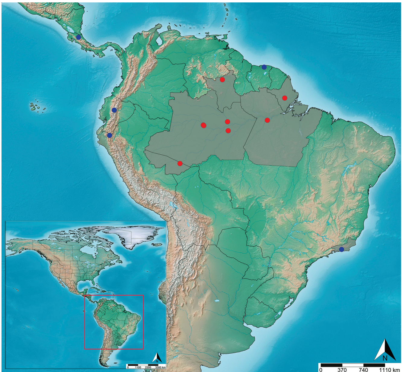
Figure 3. Geographic distribution of Creagrura nigripes Townes, 1971. Legend: Brazilian state records are highlighted in gray. The circles represent the specimens: red for new records and blue for previous records.

Material examined: 17 ♀♀ and 16 ♂♂. BRAZIL, AC [Acre], Bujari, F[loresta] ES[estadual] Antimary, 09°20'01"S, 68°19'17"W, 18-31.VII.2017, Malaise grande, E.F. Morato & J.A. Rafael cols., Rede BIA (1 ♀, INPA); same, except 18-31.V.2017 (1 ♀, INPA); same, except 25.XII.2016, Sweeping. (1 ♂, INPA); same, except 25.VIII.2006, Focagem noturna, F.F. Xavier & D.M.M. Mendes cols., Rede BIA (1 ♂, 1 ♀, INPA); same, except 19.XI-03.XII.2016, Malaise grande, E.F. Morato & J.A. Rafael cols., Rede BIA (1 ♀, INPA); same, except Cruzeiro do Sul, Rio Moa, 07°37'02"S, 72°46'15"W, 19-28.XI.1996, J.A. Rafael; J. Vidal & R.L. Menezes 0019241 (1 ♀, INPA). AP [Amapá], Serra do Navio Igarapé Cachaço, 00°52'49.8"N, 52°01'05.6"W, 20.XI.2014, J.A. Rafael &