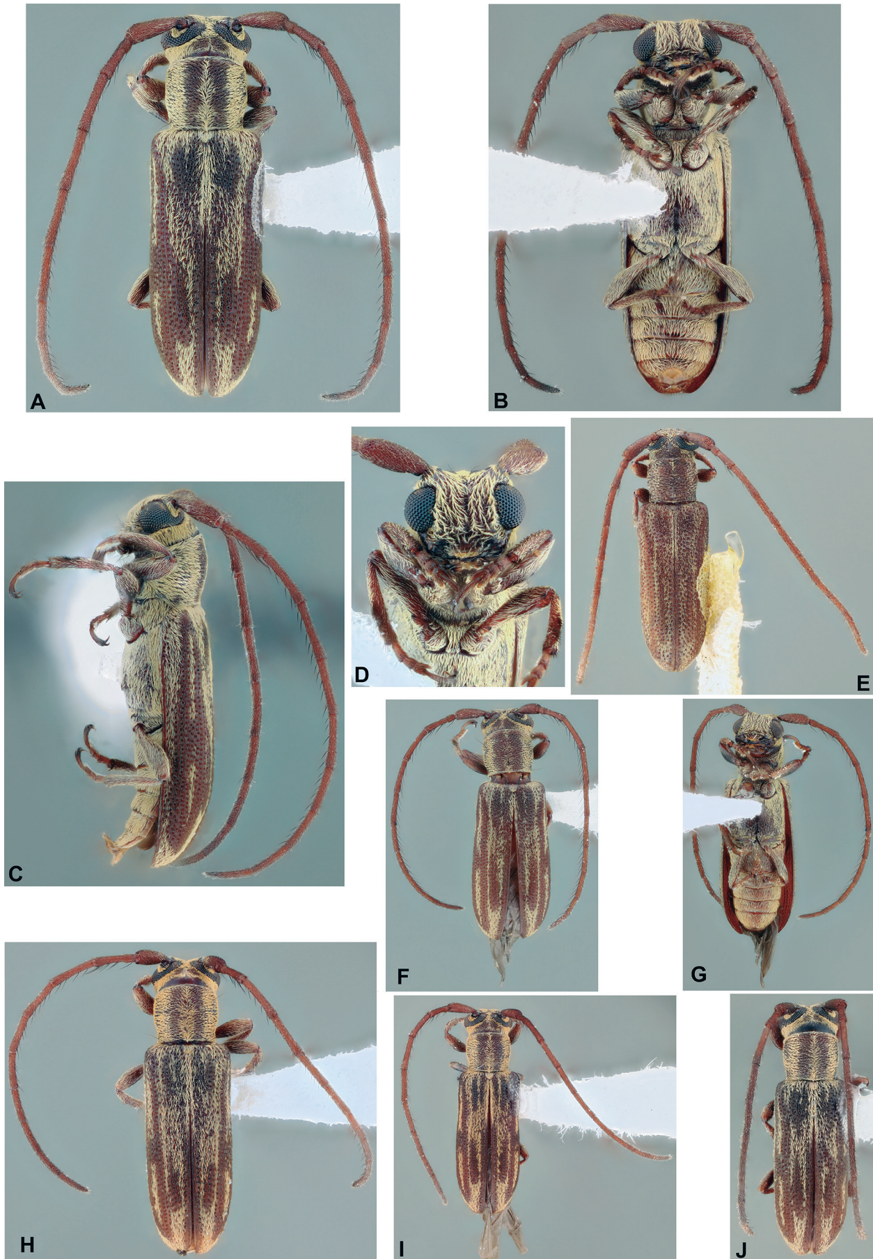
Figure 4. Rosalba strandi (Breuning, 1943). (A-D) Male, specimen 1, from Paraguay: (A) Dorsal habitus; (B) Ventral habitus; (C) Lateral habitus; (D) Head, frontal view. (E) Male from Brazil (Minas Gerais, Serra do Caraça), dorsal habitus. (F-G) Female from Paraguay: (F) Dorsal habitus; (G) Ventral habitus. (H-J) Males from Paraguay, dorsal habitus: (H) specimen 2; (I) specimen 3; (J) specimen 4.