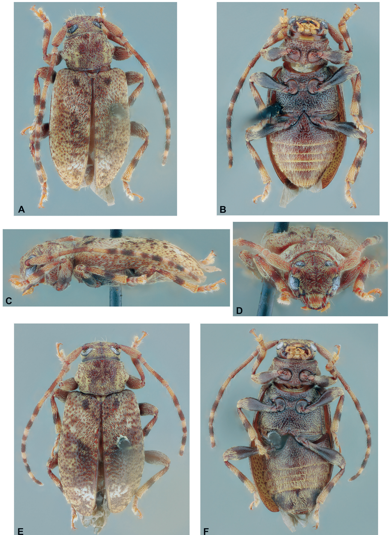
Figure 5. Nagma hovorei sp. nov. (A-D) Holotype male: (A) Dorsal habitus; (B) Ventral habitus; (C) Lateral habitus; (D) Head, frontal view. (E-F) Paratype female: (E) Dorsal habitus; (F) Ventral habitus.