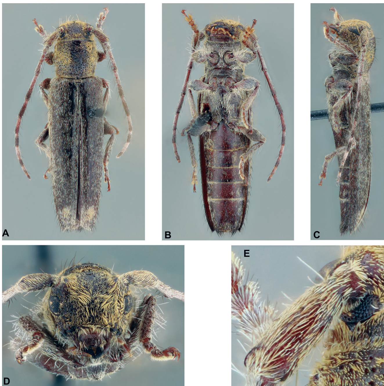
Figure 3. Bisaltes (Bisaltes) lateralis sp. nov., holotype female: (A) Dorsal habitus; (B) Ventral habitus; (C) Lateral habitus; (D) Head, frontal view; (E) Scape.

both bands, white setae more abundant near lateral tubercles of prothorax, and denser and longer yellow pubescence close to posterior margin; central region with sparse brown pubescence, except both pale-yellow and yellowish-brown setae interspersed on part of anterior third, and a few short, both pale-yellow and white setae near posterior sulcus; central area of posterior sulcus with abundant, both yellow and white pubescence no obscuring integument, yellow pubescence longer; with long, erect brown setae interspersed, especially on anterior \frac{2}{3} . Sides of prothorax (Fig. 3C) with dense, both yellow and yellowish-white pubescence. Prosternum somewhat sparsely and coarsely punctate; sides of posterior \frac{3}{4} and area close to procoxal cavities with dense, both pale-yellow and white pubescence; remaining surface with moderately sparse, both pale-yellow and