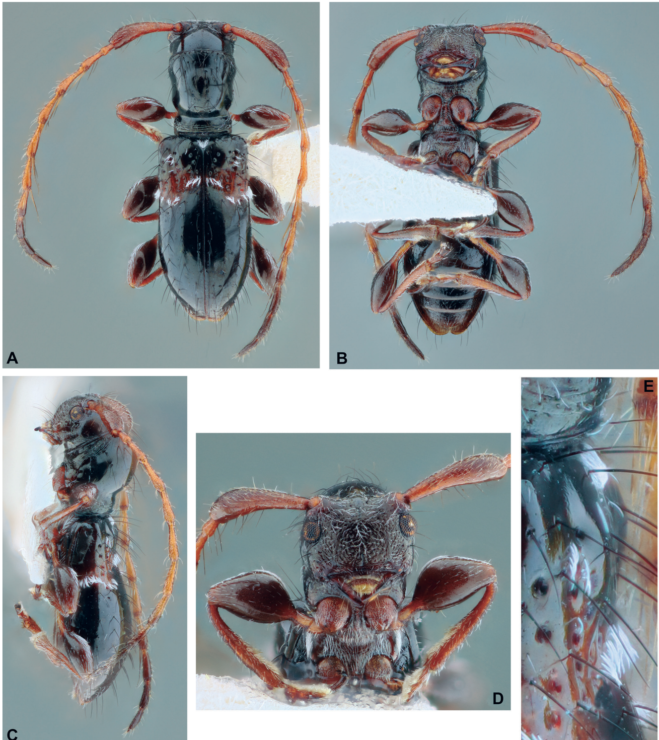
Figure 6. Cyrtinus umbus Martins & Galileo, 2009, male from Costa Rica: (A) Dorsal habitus; (B) Ventral habitus; (C) Lateral habitus; (D) Head, frontal view; (E) Elytral base, lateral view.

narrowed toward truncate apex; with somewhat sparse whitish pubescence; apex 0.55 times mesocoxal width. Metanepisternum mostly glabrous. Sides of metaventricle with somewhat abundant white pubescence posteriorly; remaining surface with sparse, decumbent white setae. Scutellum with dense white pubescence. Elytra: Anterior third, sparsely, coarsely punctate; posterior \frac{2}{3} very sparsely, finely punctate; in lateral view, slightly inclined on anterior third, distinctly convex on posterior \frac{2}{3} ; centrobasal crest (Fig. 6E) gibbosity-shaped; sides