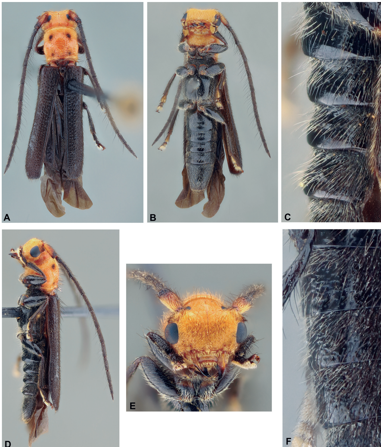
Figure 7. Phaea quadrimaculata Wappes & Santos-Silva, 2020. (A-E) Male from Mexico, Oaxaca: (A) Dorsal habitus; (B) Ventral habitus; (C) Abdominal ventrites; (D) Lateral habitus; (E) Head, frontal view. (F) Holotype female, abdominal ventrites.

of femoral club with somewhat dense white pubescence; remaining surface sparse, decumbent white setae. Protibiae with sparse, bristly white setae dorsally and laterally, almost absent on basal third of ventral surface, and dense, bristly yellowish-brown pubescence ventrally on apical \frac{2}{3} . Meso- and metatibiae with abundant, somewhat bristly white pubescence ventrally, sparse on apical \frac{2}{3} of sides, almost absent on basal third of sides and