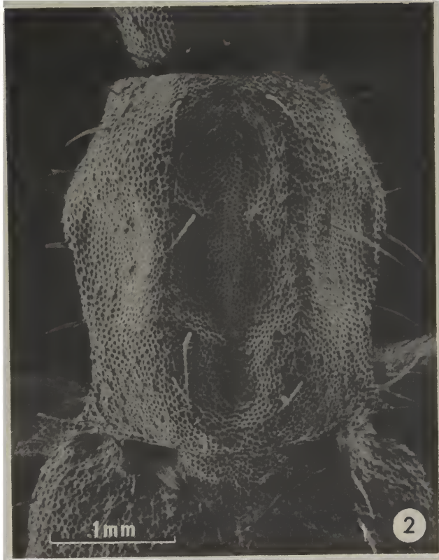
Fig. 2. Ectoxenia lucanoides , scanning electron microscope photograph of pronotum.