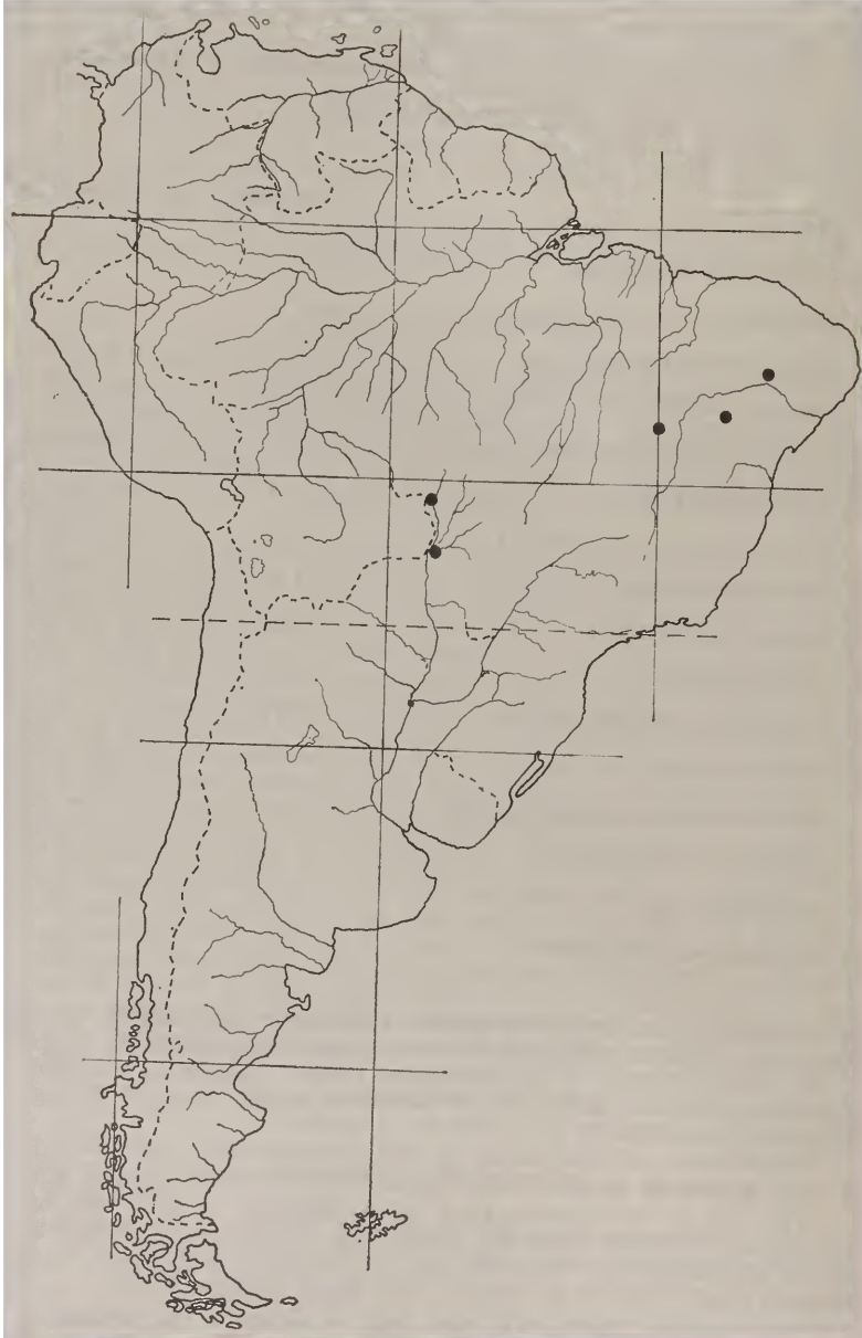
Map 3. Approximate distribution of Lygodactylus sp.