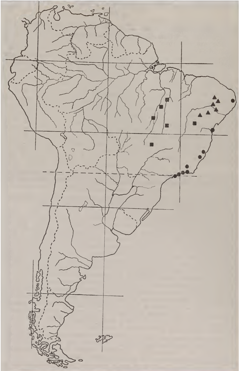
Map 2. Approximate distribution of Gymnodactylus geckoides . Triangles, G. geckoides ; squares, G. amarali ; circles, G. darwini .