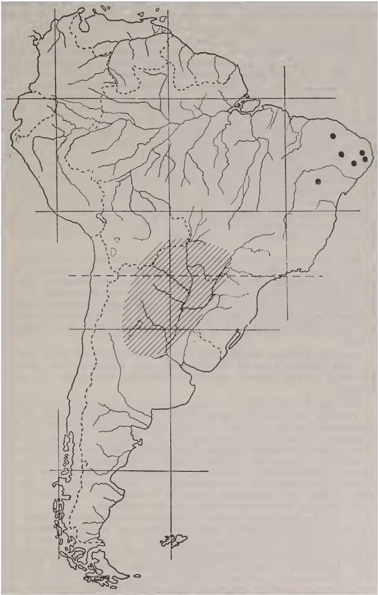
Map 5. Approximate distribution of open formation Gymnophthalmus . Circles, G. multiscutatus ; hatching, G. rubricauda .