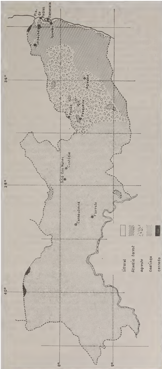
Map 1. Plant formations of Pernambuco (adapted from Lima, 1960) and collecting localities. For the area of the Atlantic forest, see comment in the text. Agua Azul is not shown, since it is very close (ca 9 km) to Timbaúba.