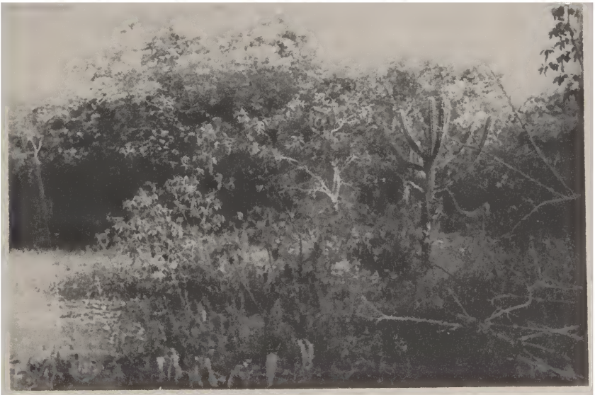
Top, agreste at Agrestina, showing rock floor (lajeiro). Habitat of Tropidurus semitaeniatus . Bottom, caatinga at Fazenda Campos Bons, near Carnaubeira. (Both photographs courtesy of H elio F. A. Camargo).