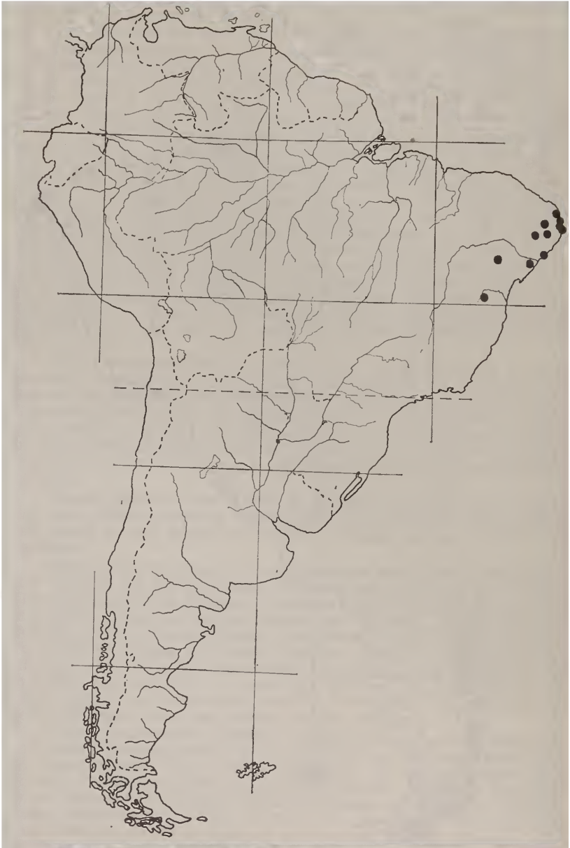
Map 7. Approximate distribution of Amphisbaena pretrei .