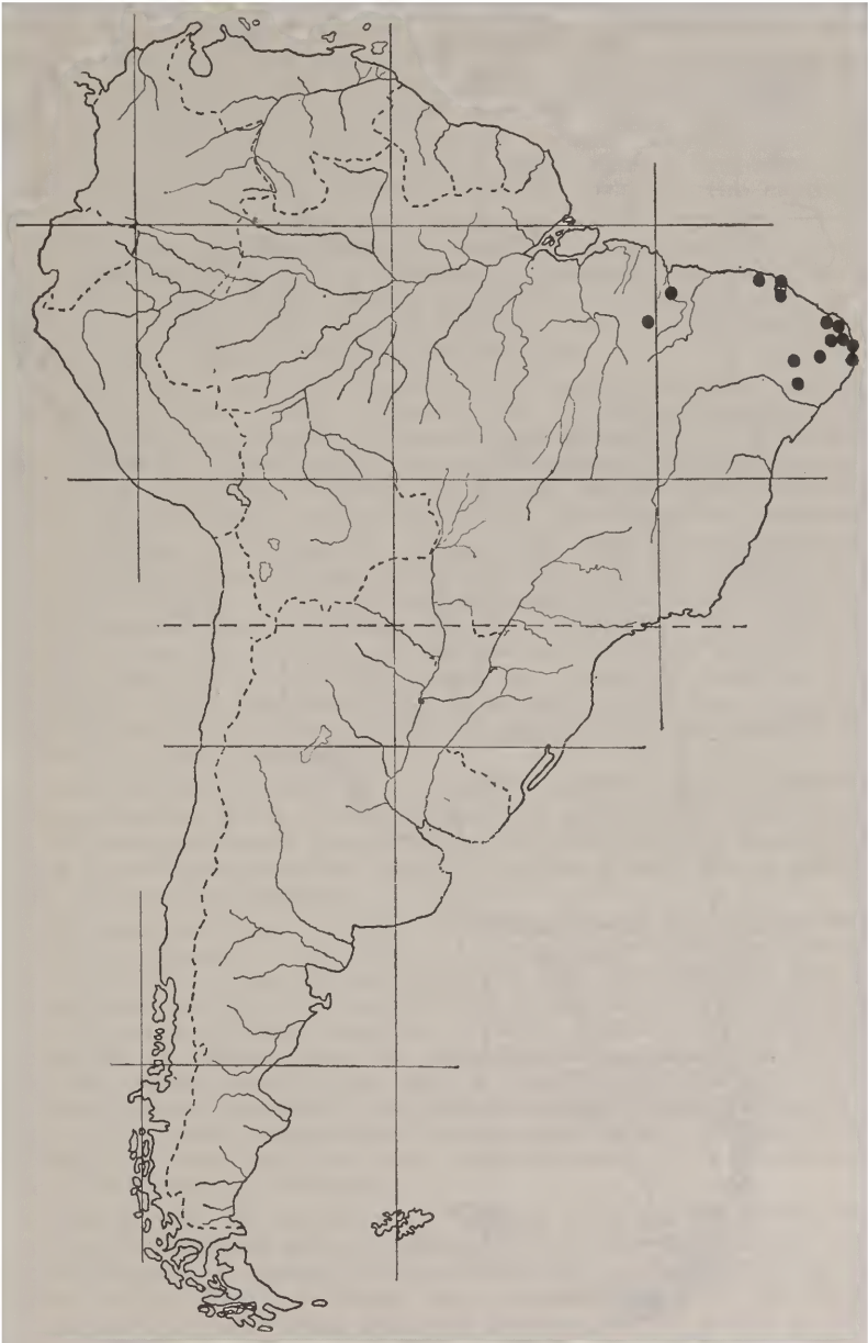
Map 6. Approximate distribution of Mabuya heathi .