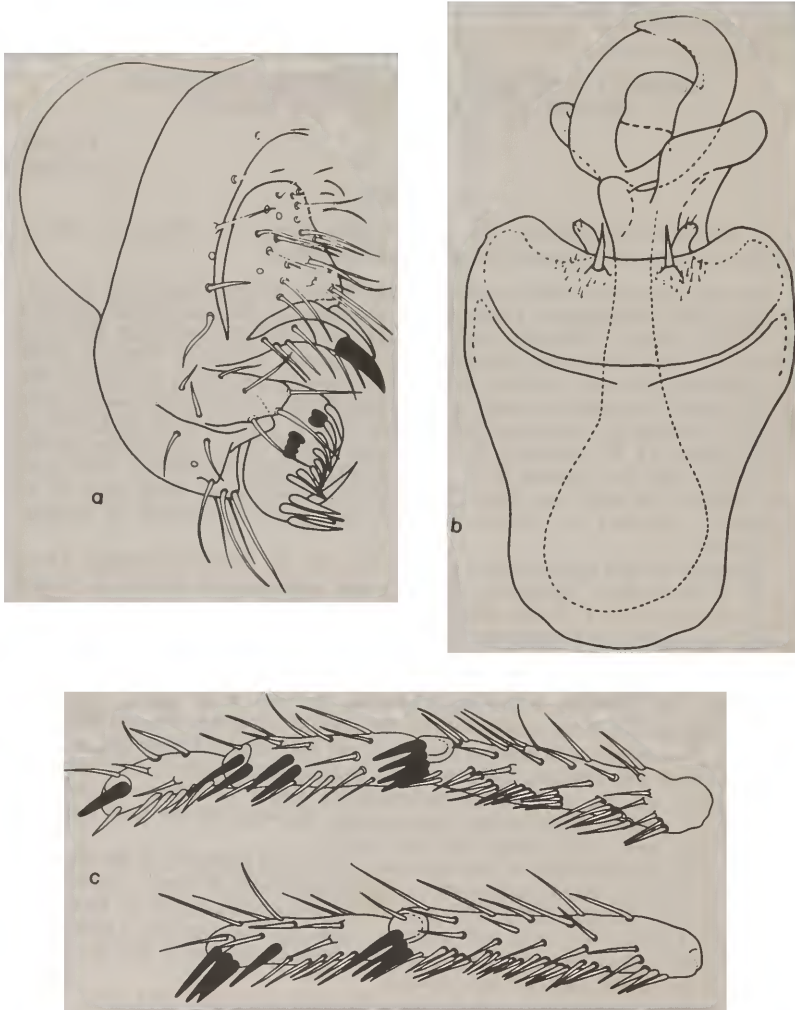
Fig. 1. D. malerkotliana - a-b - male genitalia; c - sexcombs of two specimens from Serra do Cipó, MG.