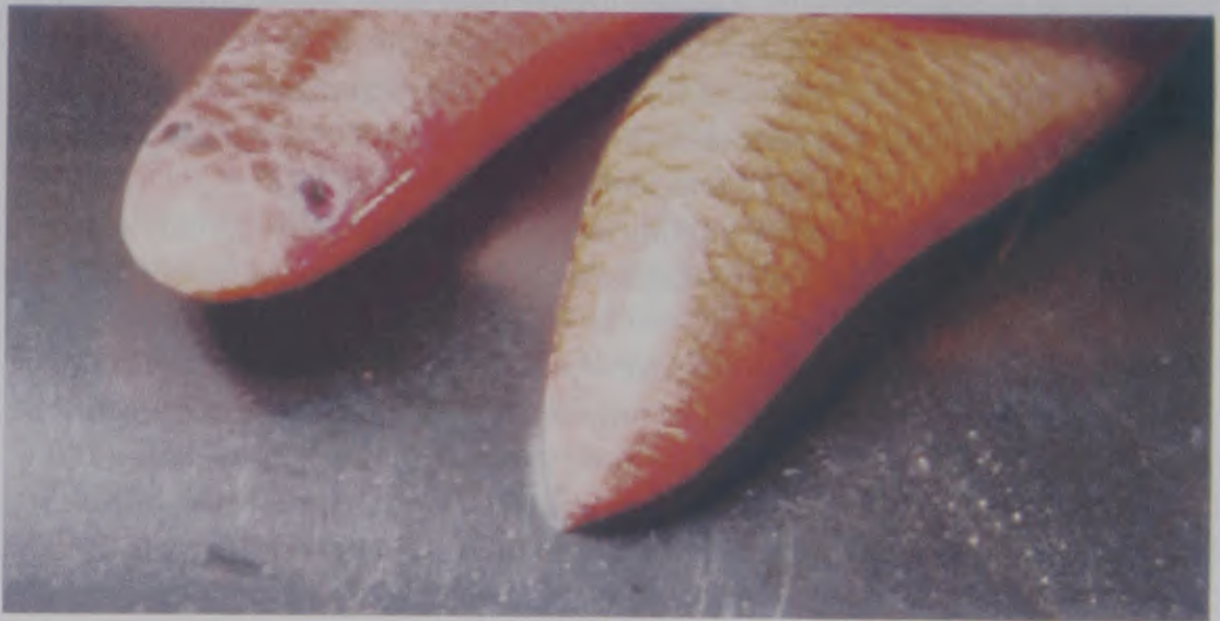
Figure 3. Typhlops amoipira (MZUSP 12299, paratype) from Ibiraba, State of Bahia, Brazil.

rostral, preocular, first and second supralabials, and frontal. Nasal wider than frontal and wider at nostril level, narrower posteriorly. Nostril in the posterior part of nasal, at the level of inferior part of ocular. Nasal suture incomplete, occupying the inferior third of nasal and coincident with suture between first and second labials. Frontal as long as large, cicloid, contacting rostral and preventing midline contact between nasals. Following frontal two imbricate and cicloid scales, the first identical to frontal in size and shape, the second wider. A pair of longer than wide distinctive supraoculars, diagonally oriented, minimally separated by frontal at midline. Supraocular covers the superior part of ocular; anterior part of supraocular imbricates under part of frontal, nasal, and preocular. Preocular large, wider at nostril level, contacting second and third supralabials, covering anterior part of ocular and supraocular, and reaching the