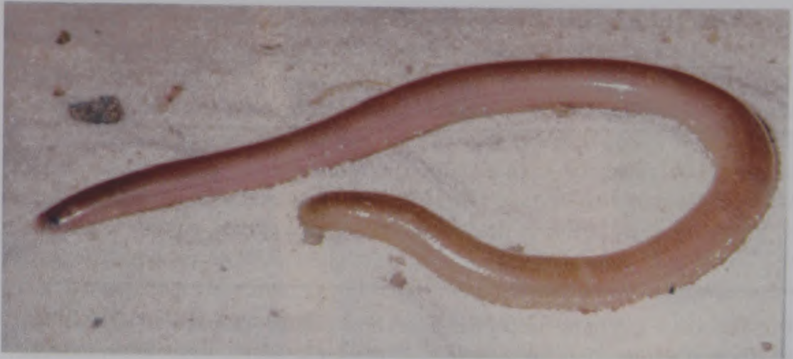
Figure 2. Typhlops amoipira (MZUSP 12299, paratype) from Ibiraba, State of Bahia, Brazil.