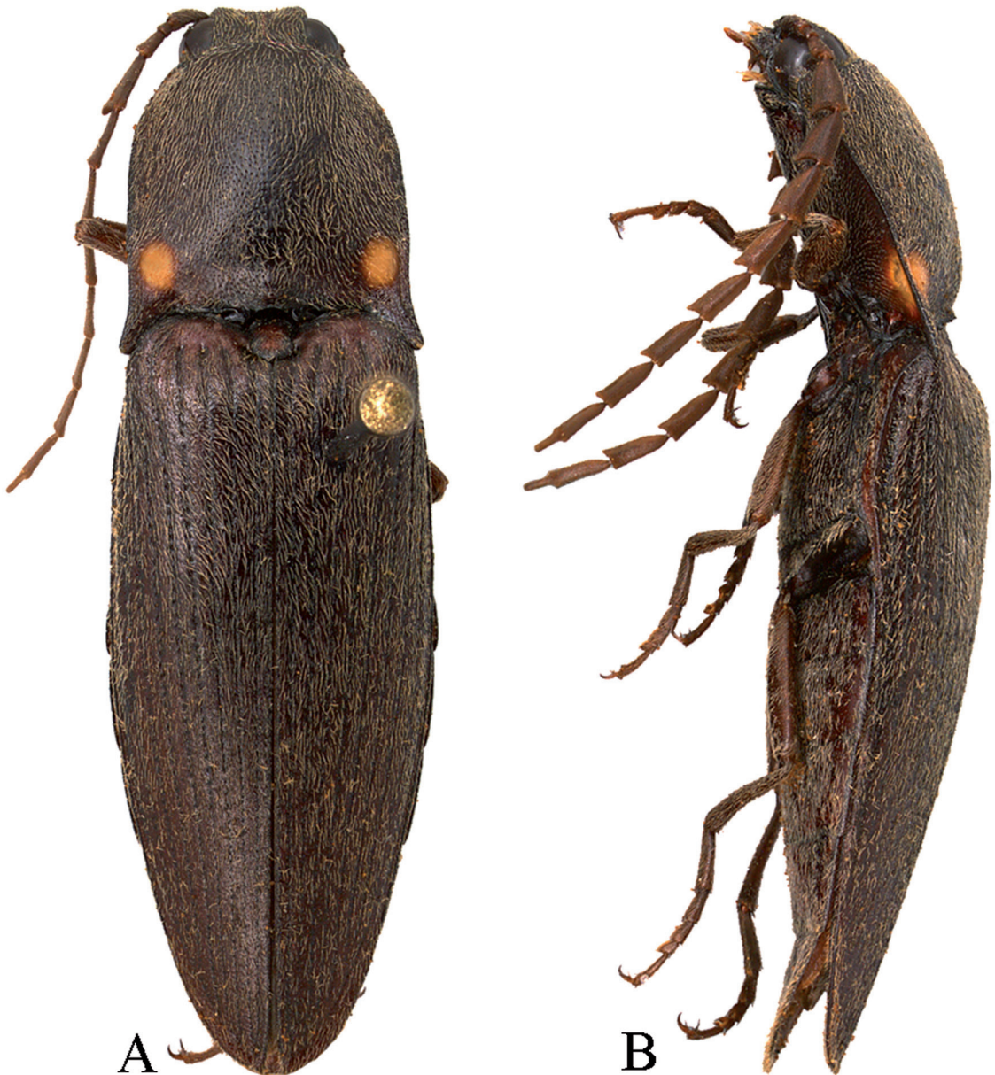
FIGURE 1: Ignelater inaguensis sp. nov., holotype male, habitus. A, dorsal; B, lateral. Length: 20.0 mm.

Prothorax : 1.00-1.03 times longer than wide, margins parallel-sided from base of hind angles up to anterior 1/3, then convergent up to anterior margin. Pronotum slightly convex, with a small tubercle on median posterior margin, punctation fine, dense and umbilicate, spaces between punctures apparently micropunctate, with a pair of luminescent organs suboval, flattened and located laterally, adjacent to the carina of hind angles; visible beneath in the hypomera. Fore angles of pronotum acute, rounded laterally; hind angles narrow and elongate, divergent, unicarinate.