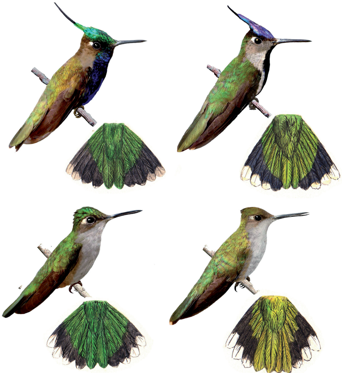
FIGURE 1: Stephanoxis lalandi (left) and Stephanoxis loddigesii (right). Males above, females below. Plate by Rolf Grantsau.

(crest, throat colouration) differ between Stephanoxis populations, the differences of which are determined not only by colouration, but by a clear geographic pattern as well. These observations are even more evident than in pairs of some hummingbird taxa which are undoubtedly considered as separate species, such as the Emeralds Violet-capped Thalurania glaucopis / Fork-tailed Woodnymph Thalurania furcata , warranting specific status to Stephanoxis subspecies also under the Biological Species Concept (Mayr, 1942, 2000). Their synonymy is given below according to Dubois' (2000) suggestions: