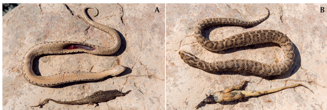
Figure 1. Dissected specimen of Gloydius halys complex with part of the body of Eremias stummeri . (A) Ventral view (dorsal view of the lizard's remains). (B) Dorsal view (ventral view of the lizard's remains).

There are several recent taxonomic and distributional studies of Gloydius from various parts of Asia (Orlov et al. 2014, Kropachev et al. 2016, Wagner et al. 2016). We can supplement these reports by providing some ecological information about these pit vipers. The food spectrum of G. halys depends on the type of habitat in which they occur and the age of the snake (Simonov 2009). The diet of adult snakes mainly consists of warm-blooded prey, such as small mammals, but observations of individuals