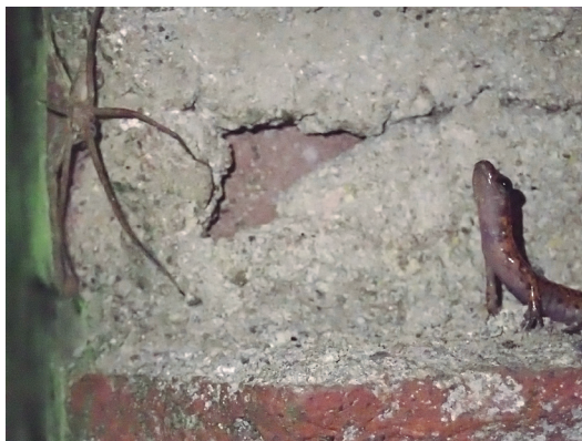
Figure 1. Aggressive encounter between a Nursery Web Spider ( Pisaurina sp.) and an adult Cave Salamander ( Eurycea lucifuga ) in the twilight zone of Sauerkraut Cave.

Herein, we provide a description of a novel interaction between a Cave Salamander and a Nursery Web Spider, Pisaurina sp. (Pisauridae), in Sauerkraut Cave, E. P. “Tom” Sawyer State Park, Louisville, Kentucky, USA, on 19 June 2016. This interaction took place ca. 3 m into the cave and 2 m high on a brick wall, which was constructed in the cave in the 1800s. There was an egg sac in a nursery web near the spider, so the initiation of the interaction was likely a display of aggression to guard the area around the sac rather than a predation attempt by the spider. In the interaction, the spider aggressively advanced toward the salamander with its front legs in the air, to which the salamander retorted by quickly advancing toward the spider, whereupon the spider withdrew around the nearby corner of the wall. The salamander stood on the tips of its digits on the front limbs, raised its head and chest nearly to the vertical plane exposing the gular region, and kept its hind feet flat on top of the wall, displaying this posture in the direction of the spider (Figure 1). Advancing again, the salamander moved toward and looked around the corner for the spider, which had retreated beyond its web. After a short time (< 2 min), the salamander returned to near its original observed position, thus concluding the interaction.