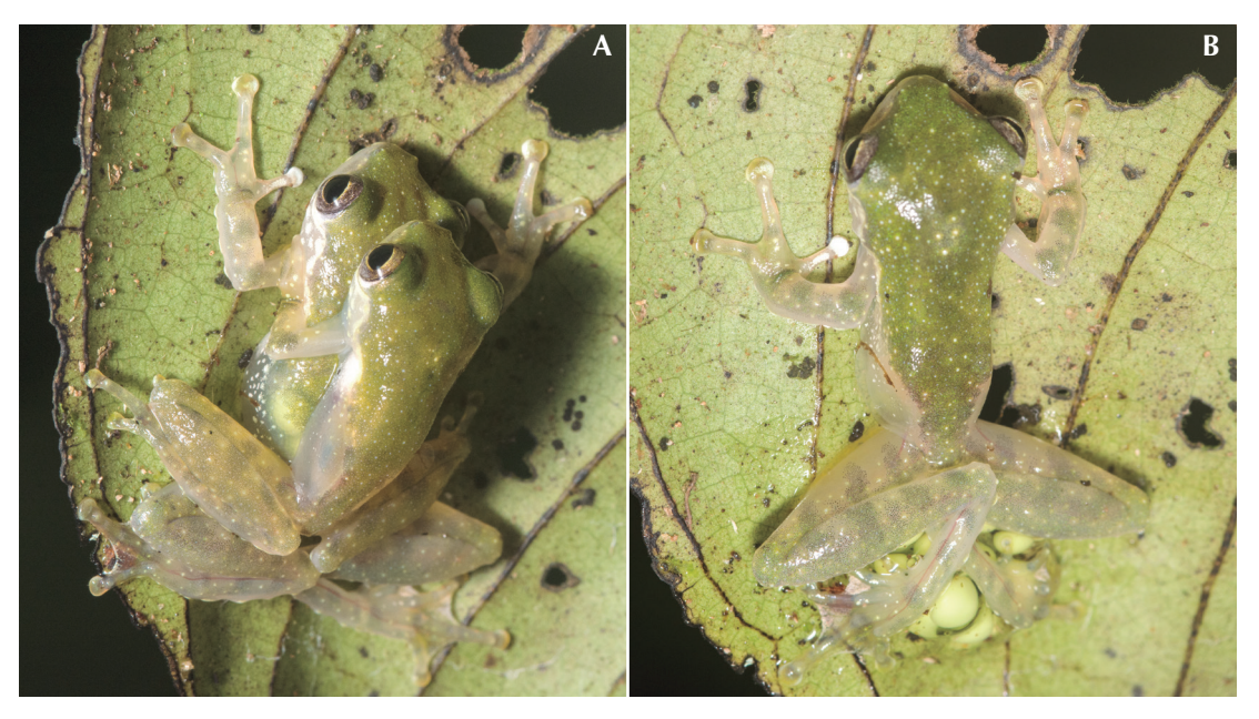
Figure 2. (A) A pair of Feihyla kajau in amplexus on the underside of a leaf in Sabah, Borneo. (B) The female remains, attending the eggs and clasping them with her hind feet.

mortality (Vockenhuber et al. 2009, Poo and Bickford 2013, Delia et al. 2017). There are no records of arthropods depredating eggs of F. kajau, but signs of invertebrate predation have been observed in egg clutches of F. kajau proximal to the present observation (A. Sorokin pers. obs.). In the closely related F. hansenae, there is intense arthropod predation pressure, which is the single largest cause of egg mortality (Poo and Bickford 2013). However, even a brief period of egg attendance can increase egg survivorship. In centrolenids, just a few hours of brooding provides eggs with days of protection against arthropods (Delia et al. 2017). Furthermore, brooded eggs are more likely to avoid desiccation during a dry period of weather, another principal cause of mortality for developing eggs. Attending parents hydrate their eggs through fluid transfer by contact with a