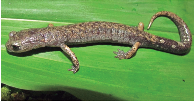
Figure 2. An adult Pseudoeurycea firscheini from Cerro Petlalcala, municipality of San Andrés Tenejapan, Veracruz, Mexico.

Our measurements of Pseudoeurycea firscheini complement the description of this species (Table 1). We documented a maximum SVL of 63.5 mm—a value greater than that of Regal (1966) (60 mm), and a maximum (92) and minimum (74) of premaxillary-maxillary teeth (PMT/MT) and a minimum of 23 vomerine teeth (VT). These quantitative data increase our knowledge of morphological variation in P. firscheini .