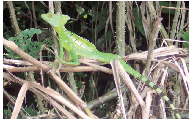
Figure 1. Male emerald basilisk ( Basiliscus plumifrons ) from El Zota Biological Field Station in Costa Rica.

Here I describe variation in the escape behavior (FID and FD) of adult male emerald basilisk ( Basiliscus plumifrons Cope, 1875; Figure 1) lizards in northeastern Costa Rica with respect to two factors, time of day (morning or early afternoon) and speed of approach (slow or fast). Both factors are known to influence the escape behavior in other lizard species (Cooper Jr. 2003a, 2006, Lattanzio 2014). I use time of day as a proxy for basilisk activity in this study because their activity exhibits a bimodal distribution with respect to time of day at my study site, with an initial peak in the early morning, followed by a suppression of activity until peaking again in the late afternoon hours (Lattanzio and LaDuke 2012). In accordance with theory (Ydenberg and Dill 1986), and the findings of previous studies (Cooper Jr. et al. 2006, Lattanzio and LaDuke 2012), I predicted that those B. plumifrons approached in the early afternoon, and those approached at a faster speed, would flee earlier and further.