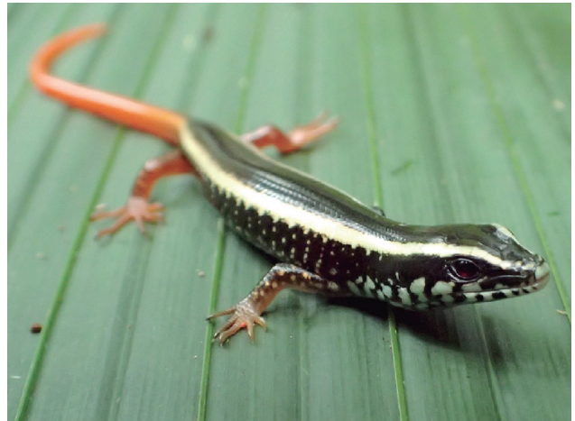
Figure 1. Juvenile Diploglossus scansorius (CM 163365) in life.

Color in life is shown in Figure 1. The color after 13 months in preservative is, as follows: middorsal surfaces dark grayish-brown, with a pair of well-defined, pale bluish gray dorsolateral stripes originating on the first pair of internasals and extending onto the tail, where they fade and blend into the yellow-orange tail coloration; upper 50–90% of most supralabials dark gray-brown, irregularly bordered with pale cream towards lower edges, with a darker gray border along posterior edges of each scale; supralabials 7 and 8 almost completely cream colored, with dark gray surrounding intervening sutures; lateral surfaces dark gray-brown, slightly lighter than middorsum, with scattered pale bluish-gray spots becoming more abundant ventrally and anteriorly, appearing most profuse anterior of forelimbs and adjacent to ventral coloration; infralabials 25–50% dark gray on white ground color and dark pigment centered around sutures between scales; ventral coloration immaculate cream-white; limbs brownish-gray along most dorsal portions, mottled laterally, and yellowish-white ventrally; ventral surfaces of hind limbs somewhat darker yellow than forelimbs, intermediate in color to forelimbs and tail; middorsal and lateral dark coloration extending onto tail forming a tapered grayish middorsal stripe and shorter midlateral stripes.