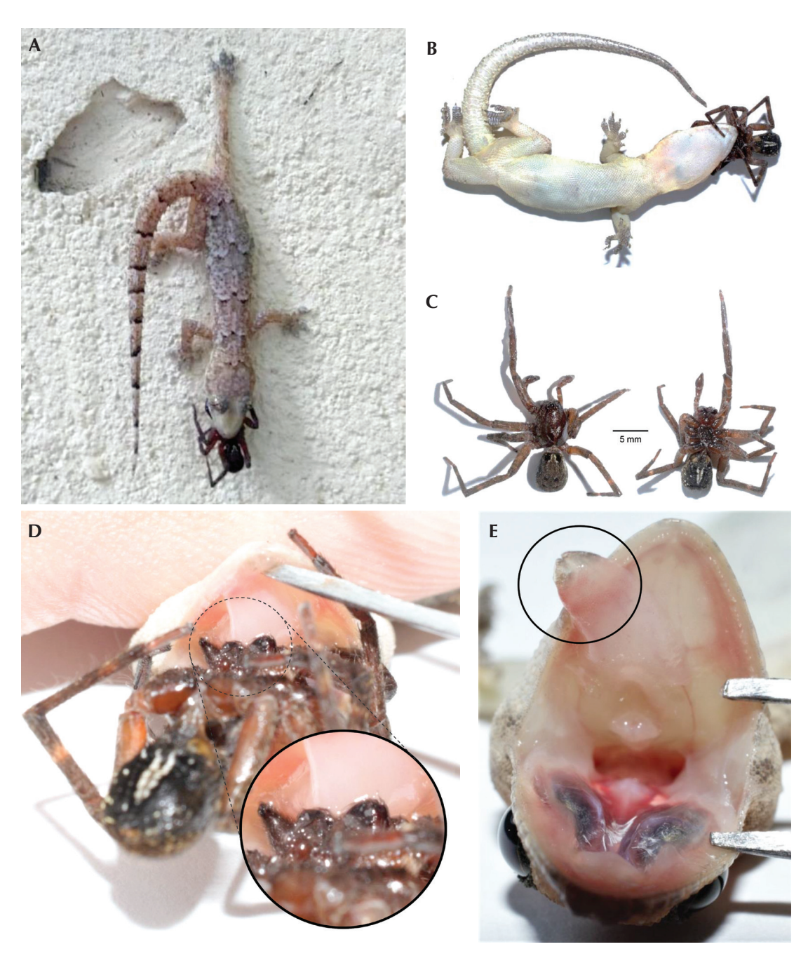
Figure 1. Observations of the envenomation of Hemidactylus mabouia (MUFAL 15013) by Ctenus rectipes (MUFAL 605). ( A ) Gecko with spider in its mouth 50 cm above floor level. ( B ) Same animals in the ventral position. ( C ) Dorsal and ventral views of spider found during the predation event. ( D ) Detail of the chelicera still inserted in the oral mucosa of the gecko. ( E ) Detail of the necrosis in the anterior tip of the gecko's tongue.