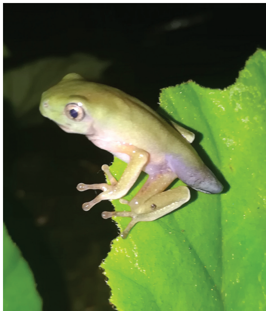
Figure 1. Metamorphosing Phyllomedusa trinitatis on a leaf beside a pond. Both images taken at the William Beebe Tropical Research Centre (Simla).