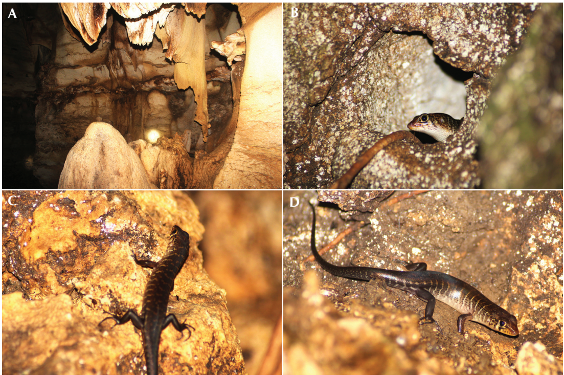
Figure 1. The Mindanao Forest Skink Pinoyscincus abdictus abdictus is frequently encountered in limestone habitat and utilized Hinophopan cave system of Loreto Dinagat Island (A) to forage for food (B-D).

Utilization of cave habitats by Philippine lizards (e.g., breeding site, foraging, refuging) were also previously reported from different parts of the Philippine archipelago. Records include Draco spilopterus (Wiegmann, 1834)