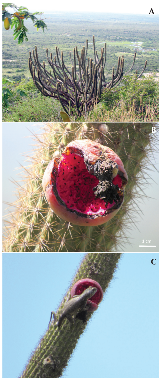
Figure 1. (A) Pilosocereus pachycladus subsp. pernambucoensis in the Serra do Jatobá, in the municipality of Serra Branca, state of Paraíba in northeastern Brazil. (B) Fruit showing black seeds embedded in the funicular pulp. (C) Tropidurus hispidus consuming fruits of P. pachycladus subsp. pernambucoensis .

Herpetochory or saurochory on members of the genus Melocactus is classified as a positive evolutionary interaction (Guerrero et al. 2012). Records of seed dispersal by lizards from cacti usually are associated with globular species Melocactus . These plants rarely reach 0.50 m in height (Taylor and Zappi 2004), which facilitates access to fruits and flowers on the cephalium structure by the lizards (Figueira et al. 1994, Gomes et al. 2014). However, other studies have shown that interactions between lizards and