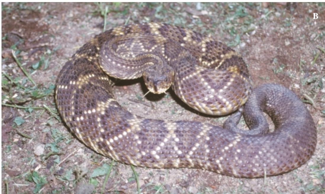
Figure 1 - Quills of the porcupine Coendou sp. piercing mouth of the viperid snakes Bothrops jararaca (A) and Crotalus durissus (B).