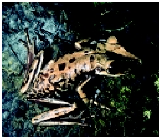
Figure 1 - Aparasphenodon brunoi from Presidente Kennedy (ES) (sex unknown).

Herein, we describe some aspects of the ecology of Aparasphenodon brunoi from a Restinga in the southern Espírito Santo state, southeastern Brazil. We address the following questions: (1) What are the patterns of habitat and microhabitat use? (2) Is there a relationship