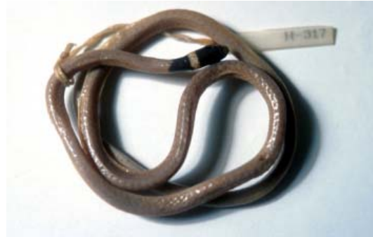
Figure 3 - The holotype of Phalotris cuyanus (MHNSR 317). Note scattered dotting on dorsum and faint dark vertebral line.

subsample C is different from both A and B, whereas the latter two subsamples do not differ from each other. A similar result is observed in the number of scales determining black collar width ( H = 15.36 ; d.f. = 2; P < 0.001 ). Indeed, multiple comparison shows that subsample C is statistically different from A and B, but these two subsamples are not different from each other.