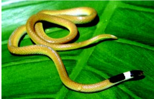
Figure 2. Phalotris tricolor (AC 419) in life. Note the light snout scales.