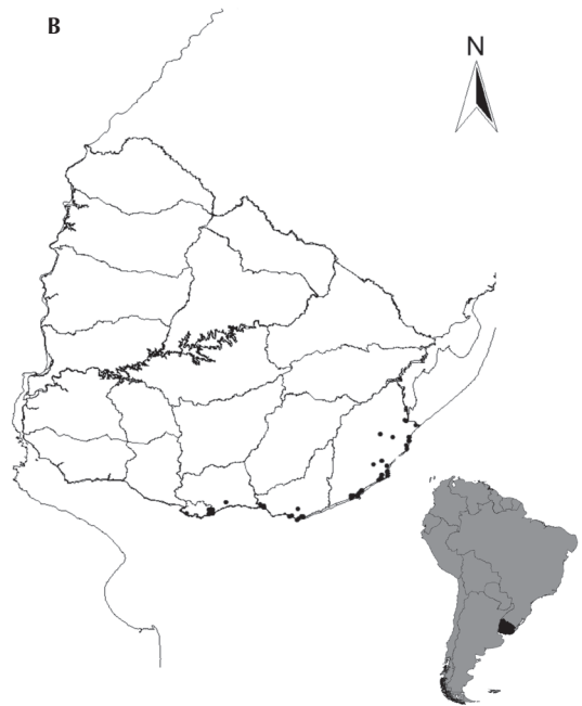
Figure 1. A) Melanophryniscus montevidensis , photo by Raúl Maneyro; B) Map of the geographical distribution of species collections used in this study (ZVCB and MNHN).

geographical distributions of Melanophryniscus montevidensis , we applied Maximum Entropy Models, using Maxent Version 3.3.1, a type of climatic envelope model (Phillips et al. 2006). This program uses a machine-learning algorithm to estimate the probability of species occurrence at certain localities, based on the environmental conditions at sites where the species were recorded. Maxent has many practical advantages that make it easily applicable to occurrence data. It requires presence-only data, and functions with both continuous and categorical predictors. The program provides a continuous model output that can be categorized according to different thresholds, and provides results that can be interpreted with Geographic Information Systems (Phillips et al. 2006). Maxent is thought to be one of the most robust modeling approaches (Elith et al. 2006).