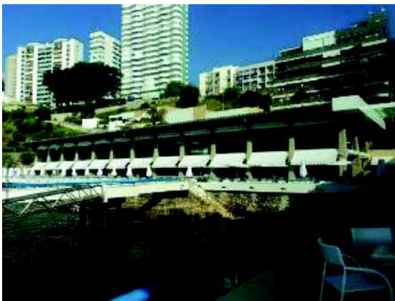
Figure 4: Yacht Club – 2015

Following the demolition of its previous premises and the construction, in 1958, of a pier, the new Yacht Club (Figures 4 and 5) is inaugurated in 1973. The architects Silvio Robatto and Alberto Fiuza adopt a prismatic block which is connected to two decks, with a hollow lower part and an upper part that initially connects the hollow and sealed parts. This allows for a wide terrace in the lower part, thereby ensuring profound integration between the building and its surroundings. The element that enables this is the robust exposed concrete structure, which is used in a modulated and rhythmic fashion. According to the architects, these columns are "oversized in the open area below, so that the iron armature of the pillars remains well within the concrete and well-protected against corrosion. For aesthetic reasons, this was constructed in a triangular form (MAIA, 1995: p.131). It is a well-resolved design and one that adapts well to its surroundings; it exists to this day.