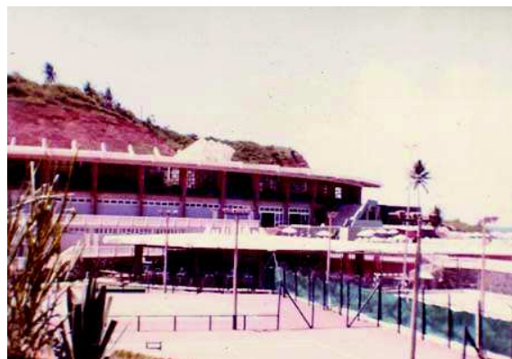
Figure 7: Spanish Club – n,d