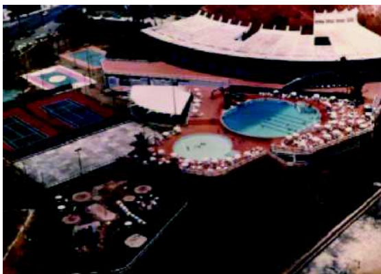
Figure 6: Spanish Club – n.d; Source: DOCOMOMO-BAHIA