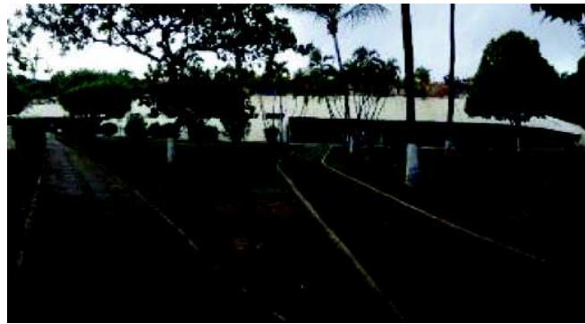
Figure 11: Banco do Brasil Athletic Association Centre – 2015.