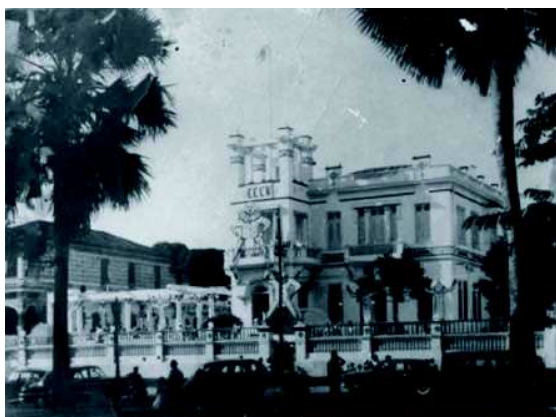
Figure 1: Cruz Vermelha Carnival Club – n.d.

One of the styles most frequently adopted by the clubs is the neo-colonial, which appears in the Bahia Athletics Association , inaugurated on 25/01/1941.