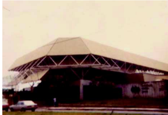
Figure 9: BANEBA Athletics Association – 1986.

blocks of different sizes and materials. The upper block facades are composed of rhythmic openings, which do not allow for a very pronounced integration between the interior and exterior. This is not a very brilliant architectural solution and is eventually removed.