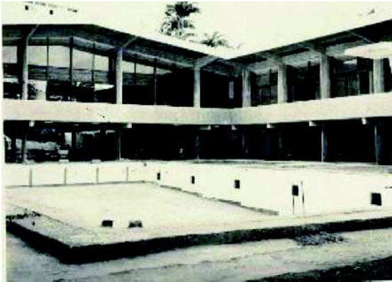
Figure 8: Banco do Brasil Athletics Association – n.d.