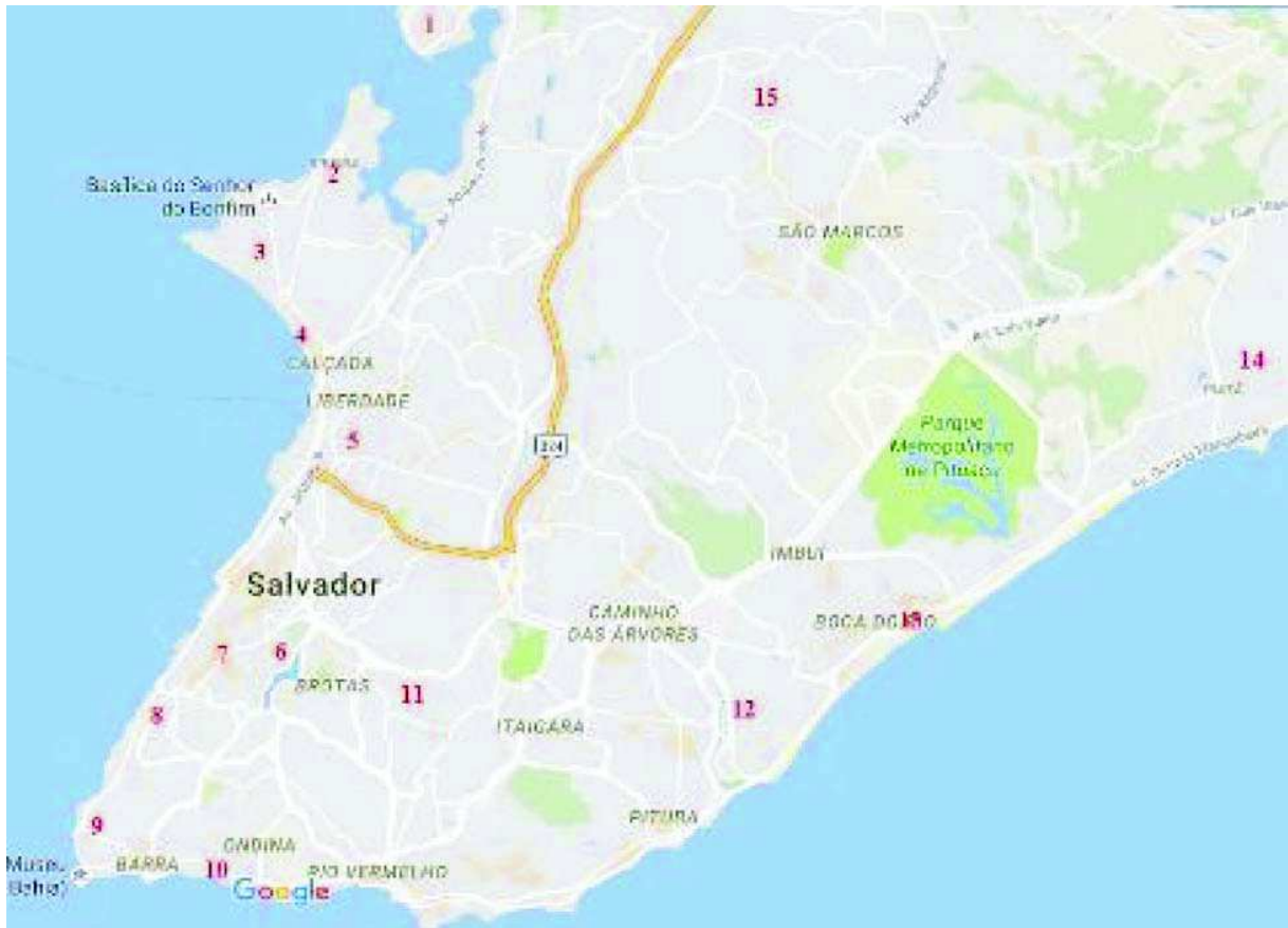
Figure 14: Locations of Salvador clubs. Area 1 – Plataforma – Corinthians de Plataforma Club, Palestra de Plataforma Club, Recreativo Plataformense Club, São João Football Club; Area 2 – Ribeira – Guaraní Sporting Association, Itapagipe’s Regattas Club, Humaitá Sport Club. Area 3 – Monte Serrat e Boa Viagem – Itapagipe’s Yacht Club, Corinthians Sport Club, Military Police Officers Club, Império Athletics Club, Rosa do Adro Carnival Club. Area 4 – Mares – Recreativo Palmeira Athletics, Vera Cruz’s Regattas, Santa Cruz Sport Club. Area 5 – Liberdade/ Caixa d’água – Filhos da Liberdade Carnival Club, Nego Athletic Club. Area 6 – Nazaré /Dique – Democrata Club; Innocentes em Progresso Club (2nd and 3rd premises). Area 7 – Piedade/2 de julho – Innocentes em Progresso Club (1st premise), Portuguese Club (1st premise), Commercial Club, Botafogo Sport Club, Fantoche da Euterpe Club, Bahia Sports Club (2nd premise). Area 8 – Campo Grande – British Club, Spanish Club (1st premise), Cruz Vermelha Carnival Club, Germânia. Area 9 – Graça/Barra – Amazonas Foot-ball Club, Banco do Brasil Athletic Association (1st premise), Bahia Athletics Association, Baiano Tennis Club, Bahia Sports Club (1st centre), Vitória Sports Club (1st premise), Sport Club Palmeira, Yacht Club. Area 10 – Barra/Ondina – Spanish Club, Lido Club. Area 11 – Brotas e Campinas de Brotas – Coumbia Sport Club, Unidos de Brotas Sport Club. Area 12 – Armação – BANEB Athletic Association. Area 13 – Boca do Rio – Bahia Sports Club (Beach Premise). Area 14– Piatã – Banco do Brasil Athletic Association (2nd Premise). Area 15 – Vila Canária – Ypiranga Sports Club (2nd Premise).