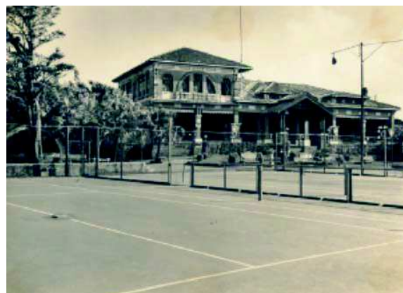
Figure 2: Baiano Tennis Club – n.d.; Source: Fundação Gregório de Mattos/PMS