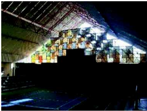
Figure 10: Baiano Tennis Club Gymnasium – 2015