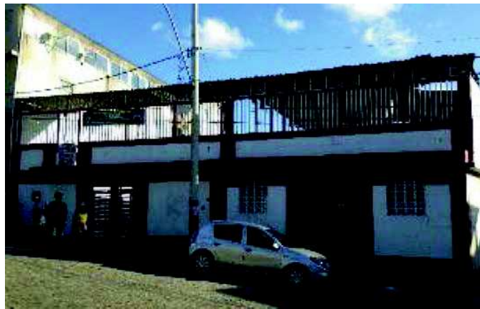
Figura 13: Recreativo Plataformense Club – 2015.

It is much more difficult to obtain information about the most popular clubs, since data regarding their architectural features is almost inexistent. Nevertheless, it is known that the city contains carnival and sports clubs. Regarding the former, remnants remain of the Filhos da Liberdade Carnival Club , Democrata and Rosa do Adro (CADENA, 2013, p.102). In terms of the latter, the first buildings of Corinthians de Plataforma , São João de Deus and Palestra appear, but their premises are demolished on unknown dates. The second building of the Corinthians (figure 12) is completely ruined (SANTOS, 2014). The only club which remains and which has some modernist references, but is in a very unstable condition, is that of the Recreativo Plataformense (Figure 13) (PORTELA, 2015).