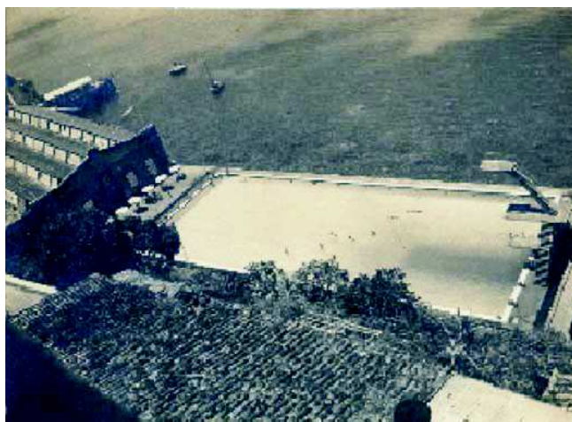
Figure 3: Yacht Club – n.d

Art Deco is one of the most widespread architectural styles in Salvador in the first half of the 20 th century. The Salvador Yacht Club (Figure 3) is situated on the location of the old shawl factory “Victoria”. Initially, it functions as a warehouse, with a striking covering and sheds “of great value” (VELAS, 1935, p.7). At the beginning of the 1940s, most of the factory structure has been maintained, but its façade is modernized, acquiring a parapet with decorative