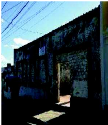
Figura 12: Corinthians de Plataforma Club – 2015.