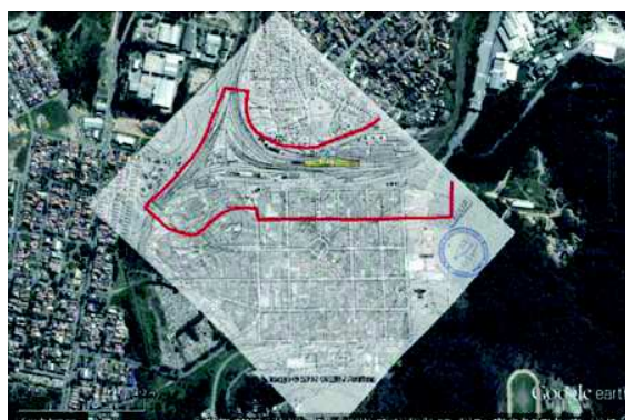
Figure 4: Surroundings according to IPHAN (2002).