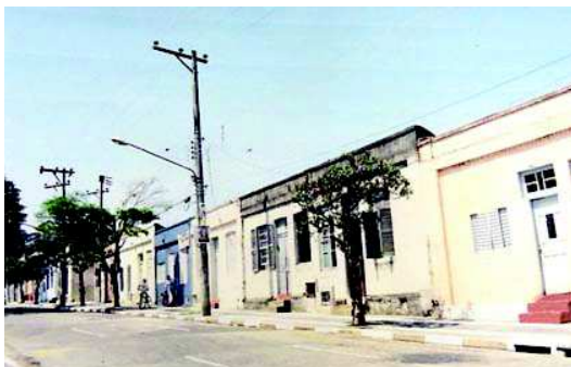
Figure 5: Historic dwelling set related to the origin of the railway of Mairinque (2002).

From the local point of view, there was the installation of a variety of services directly or indirectly related to the city's railway, such as houses, the workshops and the tree nursery (CONDEPHAAT, 1986; IPHAN, 1998) what expanded the development of this activity from a strictly operational area to the city, generating properties that articulated themselves and that allowed a certain functioning of the village. This had great relevance until the 1930s to the development, fixation and expansion of the railway activity and indirectly to the village itself, configuring then a local heritage for Mairinque.