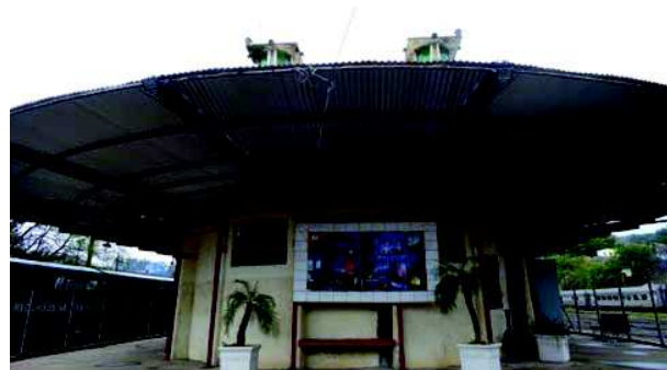
Figure 6: Landmarked Railway station (2015). Source: Authors' personal archives

Figure 5: Historic dwelling set related to the origin of the railway of Mairinque (2002). Source: Photo of Anita Hirschbruch (process n° 1434-T-98) available on the archives of IPHAN/SP. Landmarked Railway station (2015). Source: Authors' personal archives.