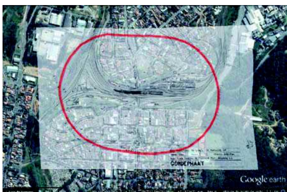
Figure 3: Surroundings according to CONDEPHAAT (2001).

The consults to the landmarking process allowed us to identify references to other goods related to the railway operation, beyond the station. During CONDEPHAAT’s landmarking process, for example, it was mentioned the importance of the workshops to the city’s development, however, the final decision of the heritage landmarking refers only to the station. Even though the landmarking of the railway set was considered on IPHAN’s process, such intention was discarded in face of the architectonic relevance of the station. In both processes were defined protection surroundings related to the station (Figures 3 and 4), which comprised great part of the buildings related to the