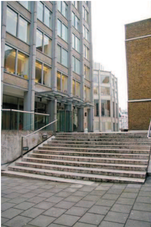
The Economist Building complex, Peter and Alison Smithson's project - London 1965