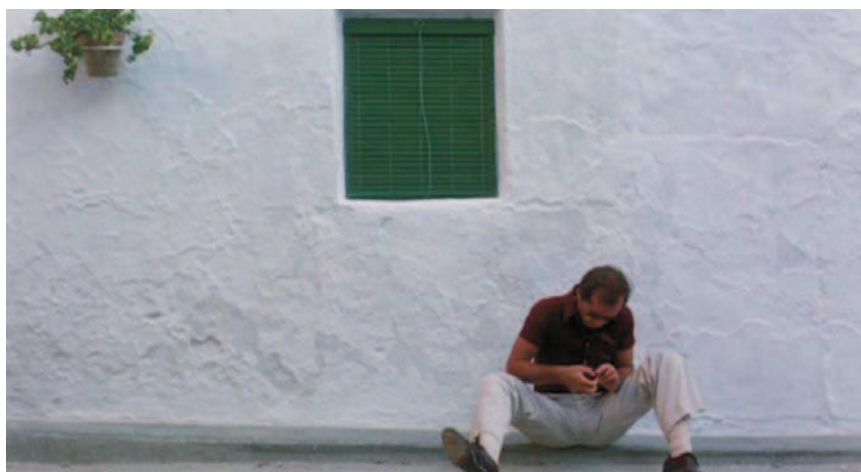
Jack Nicholson in The Passenger

life of a dealer linked to Chadian rebels. The plot is not clear, but the images and the colors describe their own history. In the first twenty minutes one can see pale sand between dunes and rocks confronting a blue, clean and clear sky. The image of black Tuaregs dressed in white robes, as well as the green Jeep and a red plaid shirt worn by the reporter contrast with this duality.