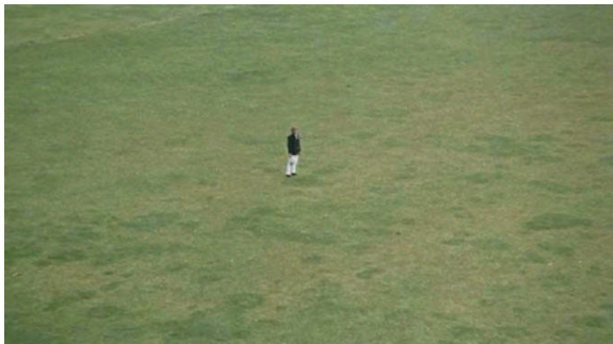
Blow Up final scene

Antonioni strongly believed cinema is a form visual art. In the play of light and shadows, the imaginary penetrates in the gaps between the frames. The director created his language based on the relationship established between script, characters, images, sounds and rhythm, highlighting a suggestive profusion of signs, and which therefore established shades of connotation. Script is considered the backbone of the cinema and everything corroborates to its development; in European cinema the story is relative; in both Impressionist and Surrealist cinema plot undertakes a secondary importance, which is reestablished to the primary importance in the Italian Neorealist. The films of Michelangelo Antonioni are aesthetically complex; scripts are less relevant, and therefore images take an important role as the structure to define his cinematography.